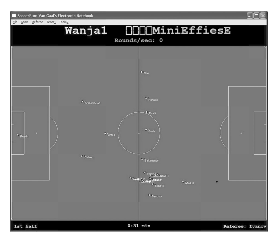
Fig. 1. The Soccer-Fun framework in action.

can be implemented in any functional programming language that supports GUI programming.