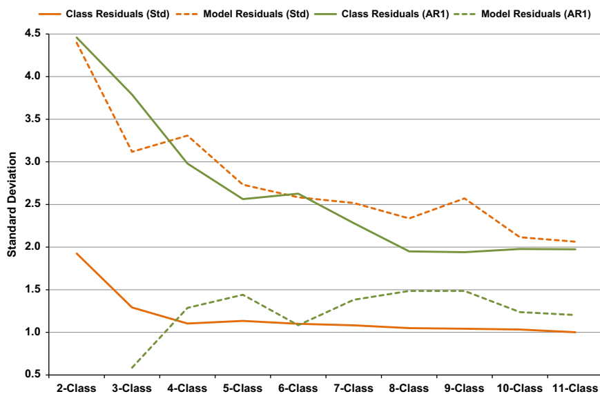
Fig. 2. Variation in class trajectory intercept residual variances and model trajectory intercept residual variance: 10 restricted standard growth mixture models (GMMs; Std) and 10 restricted AR1 GMMs (AR1); for the two-class AR1 model, intercept variance was constrained to zero to attain convergence with non-negative variances.