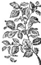
The Witch Hazel Plant.

This drug is highly commended by the British Medical Association's Committee on Therapeutics. Hazeline, being prepared from the fresh green twigs, contains all the valuable volatile principles of the plant Witch Hazel, and is much more uniform and reliable in its action than are the tinctures, fluid extracts, etc., prepared from the dried bark.