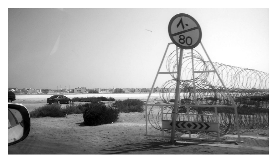
Figure 1.3 Example of a partially besieged village border (Bahrain 2015)

leader of the political Shi'i Islamic opposition party al-Wifaq. <sup>70</sup> Al-Wifaq is the largest Shi'i Islamist political party. <sup>71</sup> It tried to work within the government and occupied eighteen out of forty elected seats in the Council of Deputies before its withdrawal during the 2011 uprisings, <sup>72</sup> when the party was declared illegal and the citizenship of its members revoked, including that of Sheikh Isa. <sup>73</sup> Al-Wifaq has been accused by the government of promoting sectarianism and causing a threat to the