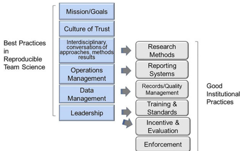
Fig. 2. Best practices in reproducible team science support the culture of good institutional practices (GIPs). Mapping the best practices in reproducible team science with the six GIPs proposed by Begley et al.

psychologically safe environment, leadership listens to all voices, encouraging all team members to participate in a meaningful way. Team members learn to share failures, ask questions, and challenge the assumptions of others, in a respectful way that encourages open discussion and debate and discourages personal attacks. Team members meet their commitments and trust colleagues to do the same.