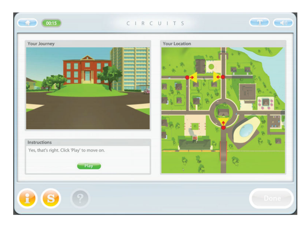
Figure 2. CIRCuiTS exercise

Metacognitive model implementation into the programme. The development of metacognition is explicitly targeted through a "metacognitive journey": (1) introduction to CIRCuiTS; (2) your goals; (3) your strategies; (4) your daily life; and (5) your achievements. Service users set goals and identify personal strengths and difficulties, which are regularly reviewed and modified.