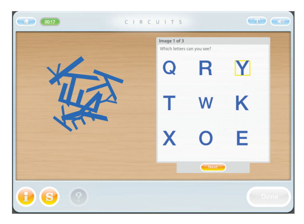
Figure 1. CIRCuiTS abstract task