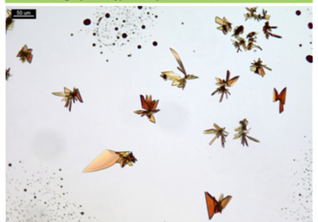
Figure 1. 1 PPP of codeine and 10 \mu L of reagent. Crystals form rosettes of triangles and hatchet blades.