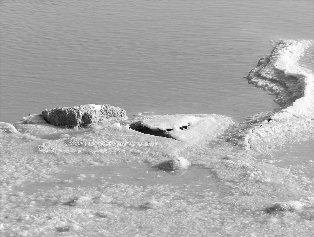
34. Salt accumulation by one of the shores of a lake in Wadi al-Natrun, Egypt.