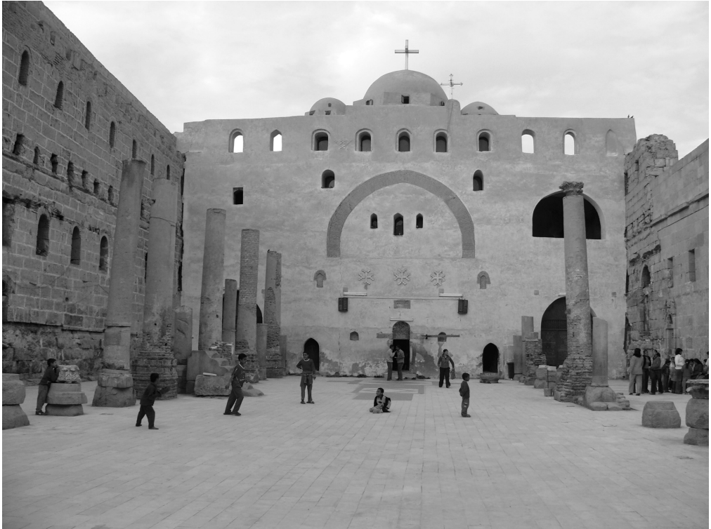
37. The church of St. Shenoute at the White Monastery in Sohag, Egypt.