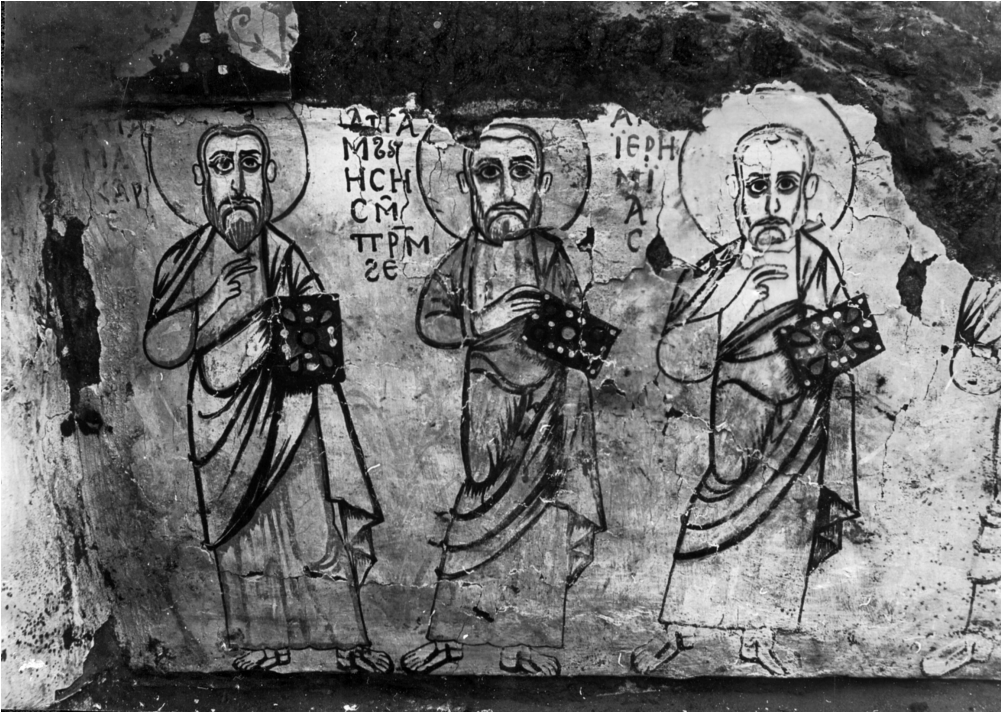
36. Wall painting from Chapel 56 at Bawit showing three monks: Apa Makarios, Apa Moses the Freeman, and Apa Jeremias.

and is the site of the Monastery of Apa Apollo. In contrast to Sketis's, whose reputation spread widely outside of Egypt to the Mediterranean world, Apollo's community was less well known, perhaps because of its southern location and the fact that fewer foreign, Late Antique Christians traveled to it. The Monastery of Apa Apollo's location should not, however, suggest it was small or insignificant. The central built community covered an area of 40 hectares and its walls were painted with the faces of numerous monks who may have once lived at the community in the sixth and later centuries (see Fig. 36). If the remote cliff dwellings are included in the area, the community expands to an area of 78 hectares, although not all of the land was used for building. Bawit is roughly half the size of Al-Ashmunein (Gk. Hermopolis Magna) (65 hectares), one of the largest cities in Upper Egypt for this period. This comparison illustrates that Bawit was a medium-sized town in its own right. Given Bawit's size and significance as a major settlement in Middle Egypt, how does its foundation narrative history contribute to a history of monastic authors crafting a generalized landscape, which overshadowed the reality of the actual monastic landscape?