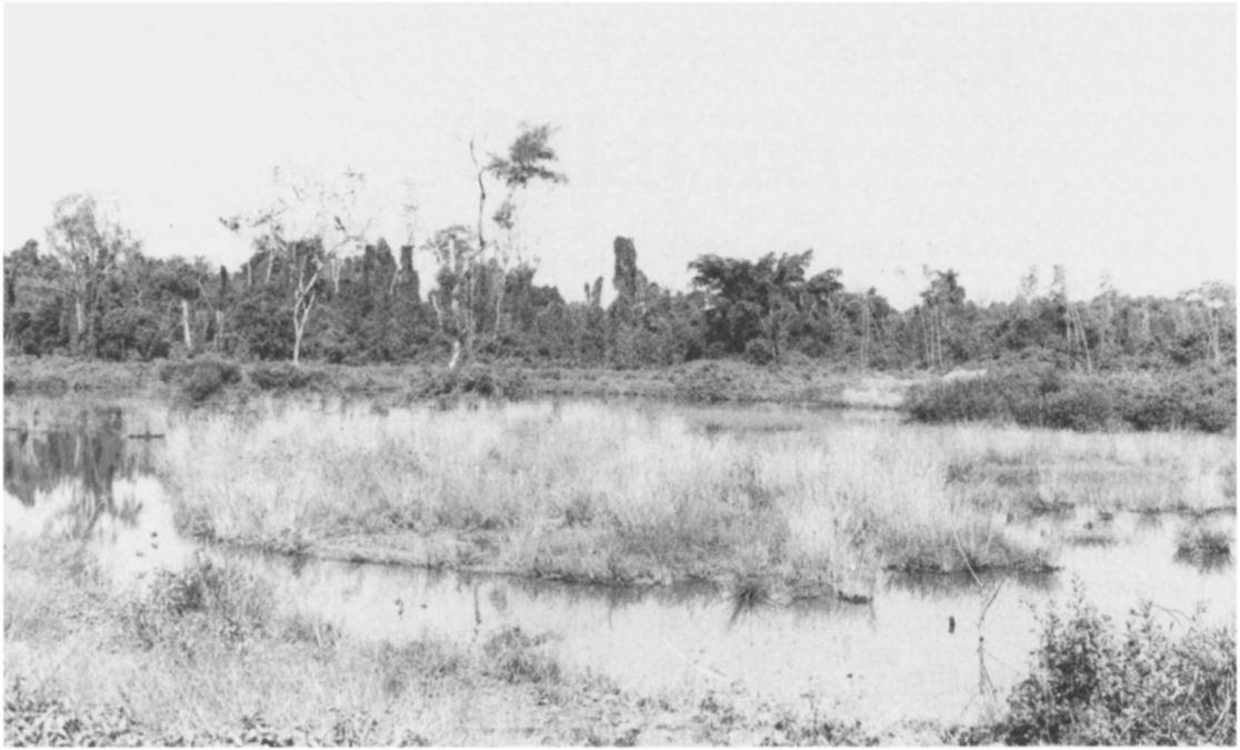
The new lake system, backed by degraded mangroves.

shallow interconnected lakes, each with a perimeter channel 1–1.5 m deep to prevent access by man and stray dogs. Most of the remaining water area is less than 0.3 m deep. Islands were constructed of spoil, covered by heavy duty polyvinyl plastic and by shell grit. More spoil was used up in surfacing an access road for maintenance. The favourable soil type has not led to acid sulphate conditions in the lake, which was filled by pumping from an adjacent Irrigation Department canal.