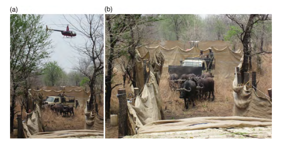
Figure 15.2 Final stage of a buffalo mass capture: (a) buffalo are chased into the boma by the helicopter; (b) then pushed into desired sections of the boma or lorry using an adapted vehicle.

protection can be used to achieve this by slow 'persuasion' (Figure 15.2). Buffalo will attack the vehicle, especially the front and wheels, rather than target the people inside. Adding a curve to the handling facility, or hanging vegetation at the far end of the boma to camouflage the dead end, leads the herd into thinking that there is an attractive way of escape, and its leaders will eventually move on towards that (Figure 15.1).