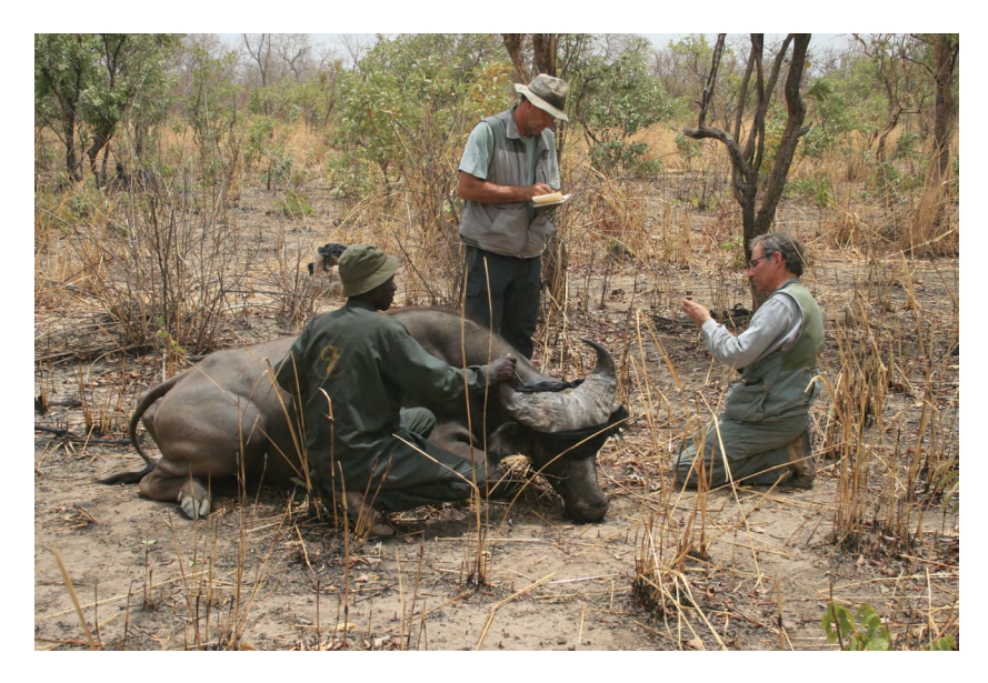
Figure 15.3 Individual darting on foot of a West African savanna buffalo.

to these, such as the potent opioids used for buffalo, humans are unfortunately extremely susceptible to the same effects, which can rapidly be fatal. Safety procedures are paramount and must be thoroughly applied.