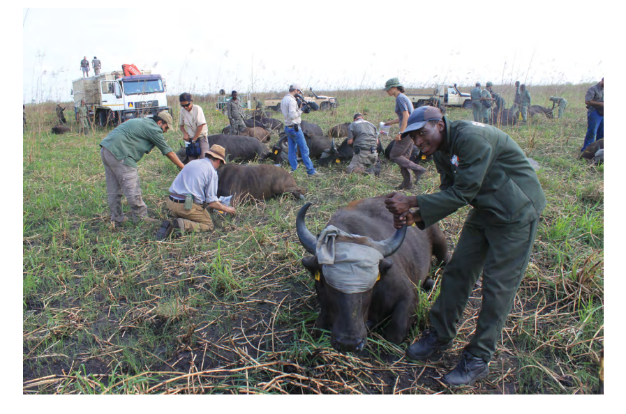
Figure 15.4 Chemical capture of a free-ranging herd of Cape buffalo by individual darting from a helicopter.

buffalo are quite easy to approach on foot provided the stalking is done very strictly against the wind. However, approaching buffalo by foot close enough for darting becomes a difficult exercise in poorly managed areas where harassed buffalo become very shy. Operational success hence may drop from darting a few buffalo each day to just one buffalo every few days, especially if specific individuals are targeted (e.g. an adult female or collared individual for device removal). Lone males are the easiest to get close to, followed by male coalitions. Herds are more difficult, however, often with males following behind.