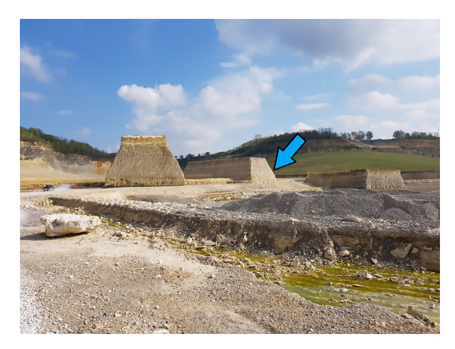
Figure 2. Photograph of the north-western corner of the former ENCI-HeidelbergCement Group quarry (Sint-Pietersberg, Maastricht) with good exposures of nearly all members of the Maastricht Formation and site of provenance of NHMM 2022 009 (indicated by a blue arrow).

The circumference around the mid-shaft measures 17 mm (Fig. 3). The bone is hourglass-shaped and well-preserved and does not reveal any traces of transport and erosion, with the exception of minor damage near the articular facets (articular subchondral surfaces). Both these surfaces are near circular in outline and are slightly convex with a highly rugose bone structure consisting of irregularly distributed bony ridges (Fig. 3C, D). Between these ridges, some less ossified areas are seen with a more open bone structure, and both surfaces display foramina. The latter are here interpreted to indicate transphyseal vascular channels that penetrated into the covering cartilage in vivo, comparable to the phalangeal anatomy as is seen in some extant reptiles, for example, leatherback turtles (Snover & Rhodin, 2008). The bone surface of the shaft of NHMM 2022 009 is smooth, but does contain numerous small pores, as well as a few larger ones. Since phalanges of the adjoining finger and toe bones were closely connected in plesiosaurs and were likely held together in a layer of tendons and ligaments (Everhart, 2017), these pores might indicate foramina of vascular canals and attachment points of ligaments (see Snover & Rhodin, 2008). Towards the edges of the articular subchondral surfaces, the bone surface of the shaft becomes slightly rougher.