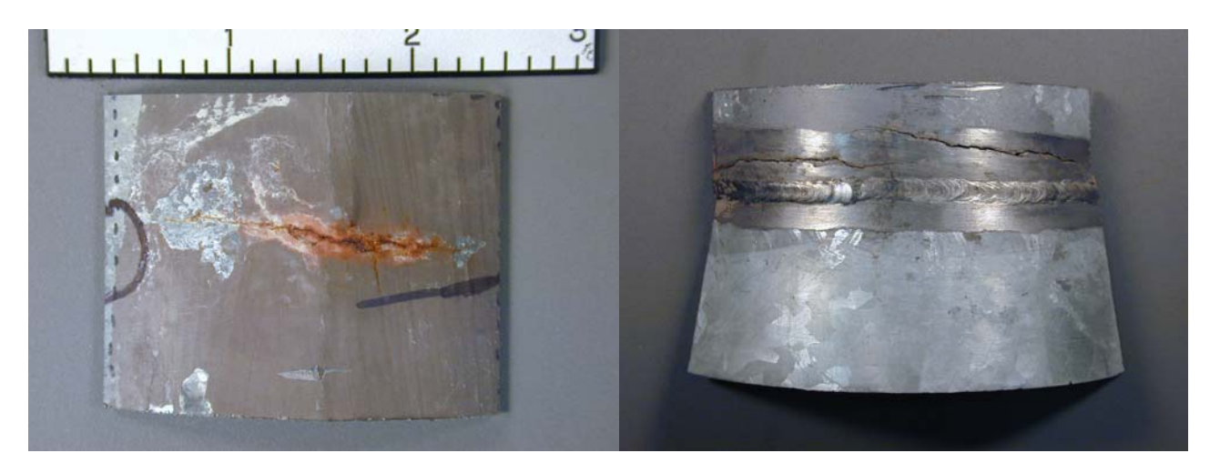
Fig. 1. Sections of pipe from vent system on waste tank. Cracks are in heat affected zones of welds.