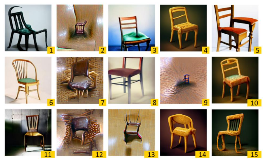
Figure 1 - Worksheet for the experiment with all 15 chair concepts presented.

To better understand the use of publicly available text-to-image AI as a substitute for designers during the conceptual design process and initial exploratory study was devised asking participants, students of the Research Studies class at DMEM, University of Strathclyde, Glasgow, UK, to take part in a concept evaluation experiment. The product chosen for the experiment was a chair based on its simplicity and familiarity. 20 participants took part in the study in six teams (four teams of three participants and two teams of four participants). Participants were 55% male and 45% female of ages between 21 and 24 (Mean 22). Participants were final year (5th year) Masters students studying Product Design Engineering, Product Design and Innovation, and Sports Engineering.