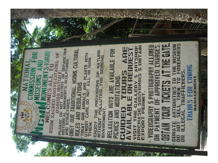
FIGURE 5. NCMM billboard.