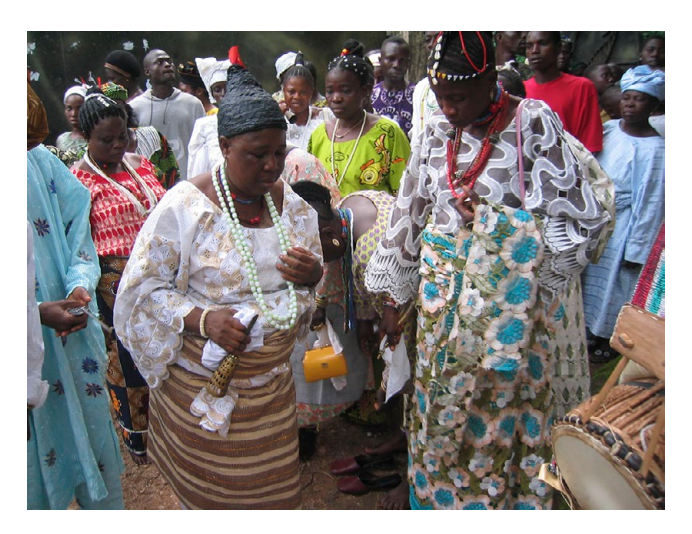
FIGURE 6. Osun priestesses.