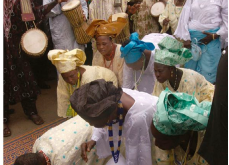
FIGURE 7. Osun priestesses.