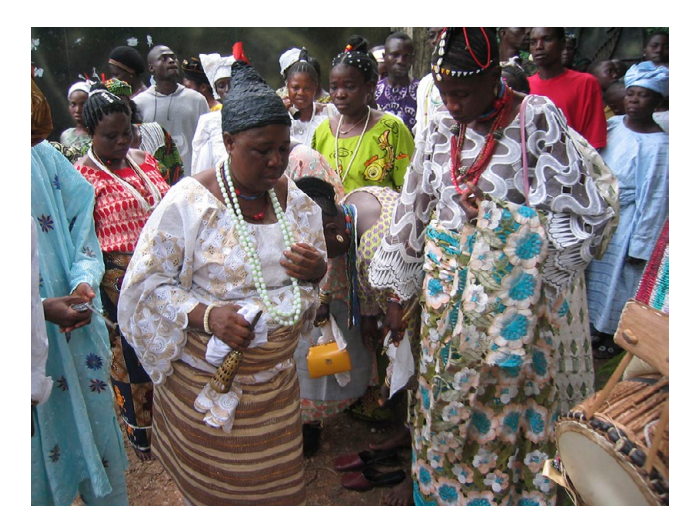
FIGURE 6. Oba Jimoh Olanipekun, Larooye II ( left ) and people paying obeisance to the king ( right ).