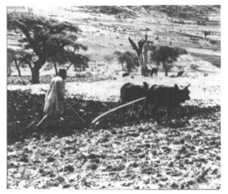
From A History of Ethiopia