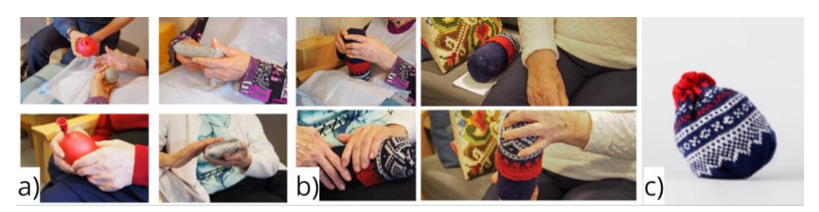
Figure 5a) Exploring experiences with different tactile objects; Exploring a tangible musical experience; c) The Egg.

The students gained interviewed a nurse specialised in music for dementia patients. According to her, music is a limitless remedy – calming down even patients expressing restless or aggressive behaviour straightaway. Songs from patients' childhoods are often still in their memories. Most patients, however, are completely dependent on the staff to play the music. A user study was conducted to explore dementia patients' experiences with feeling different tactile objects (Figure 5a). Eight material samples were explored and received diverse responses – smiles, curiosity, dislike and articulated childhood memories. Another user study involved a prototype consisting of a Bluetooth speaker set to play a traditional folk song and wrapped in a knitted cover with a classical Norwegian pattern. The patients were given the gently vibrating speaker to hold while listening (Figure 5b). The patients showed a particular interest in the experience; some sang along, and others held it close to their ears. The pattern was recognised and appreciated. The students concluded music to be favourable in that it made the patients light up, actively sing along and generally appear very content. The tangible aspects seemed to make it easier to connect with the music.