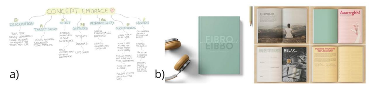
Figure 2a). Pillars of the 'Embrace' concept; b) The 'FIBRO progress journal'.

The students developed a concept called 'Embrace' (Figure 2a). The idea was to make a tool for young, newly diagnosed patients with fibromyalgia to adjust to their new life by promoting a mindset that can help them transform negative emotions associated with pain into hope, motivation and overall acceptance.