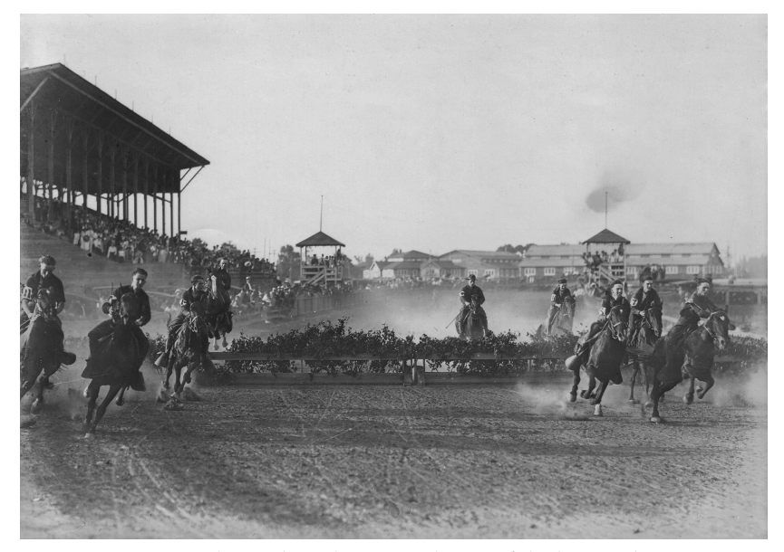
FIGURE 1.1 Savannah's Tenbroeck Racetrack, site of the largest slave auction in US history.

But on this sad occasion, it housed those on the opposite end of the spectrum: those without property, much less horses; those who were