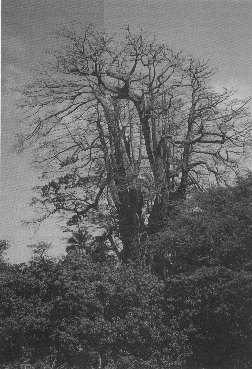
Figure 2. Breeding site of the Santiago Purple Heron in kapok Ceiba pentandra , Boa Entrada, Santa Catarina region, March 1990.

from single visits in September 1988 and October 1989 were received from J. P. Ledant ( in litt. 1988) and R. L. Miller ( in litt. 1989) respectively. The highest number of adults present was five on 6 November 1988 and again five on 2 February 1991. There were six occupied nests in September–November 1988 and four in October 1989. On 23 October 1988, six young were observed in the nesting tree, one of which was 2–3 weeks old while the others were 5–6 weeks.