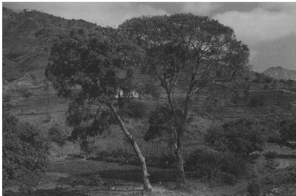
Figure 3. Breeding site of the Santiago Purple Heron in mahogany Khaya senegalensis , Banana, Ribeira Montanha, January 1991.

During visits in May 1989 and April 1990, no herons were present. The latest spring dates are of one adult on 3 March 1990 and one full-grown young on 21 March 1991. The population at Boa Entrada was thought to be less than 10 pairs.