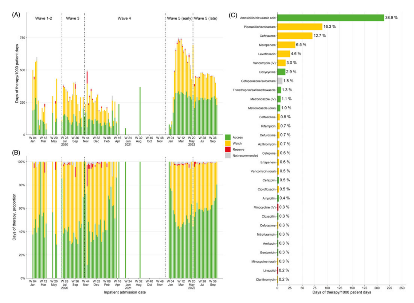
Figure 2. Weekly rates of antibacterial drug consumption (A), proportion of antibacterial days of therapy (B), and the 30 most prescribed antibacterial drugs (C) classified according to WHO AWaRe group. For each drug in C, the label on the right indicates the drug's share of all antibacterial drug days of therapy. N.B. Cefoperazone/sulbactam is recommended in local treatment guidelines for the treatment of infections caused by Acinetobacter baumannii and Pseudomonas aeruginosa .<sup>23</sup>

changes that more severe patients could likely receive medical care with a severely stretched healthcare system.