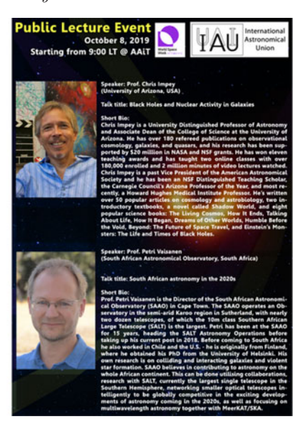
Figure 1. Left: Group picture from MSc/PhD students and young researchers training. Right: Poster with announced public talks.