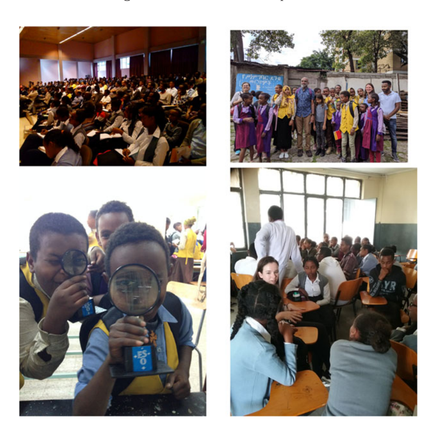
Figure 2. Top left: Group picture from AAU during public talks. Top right and bottom: Outreach activities in schools.