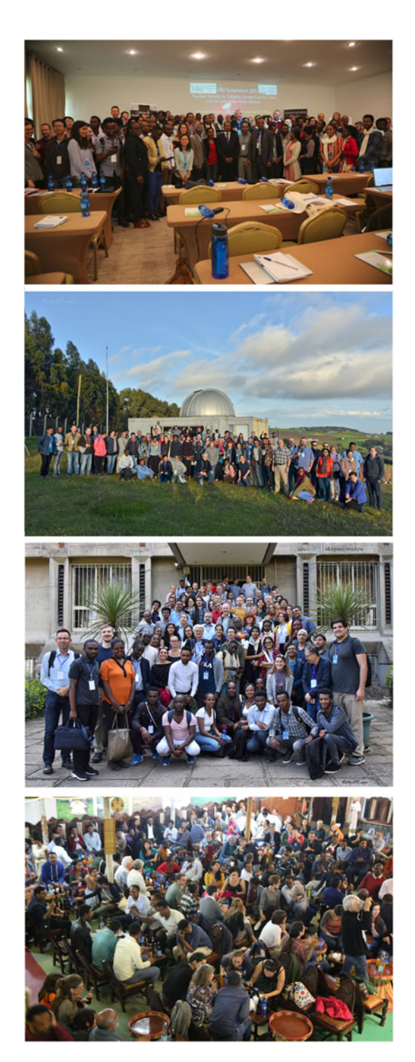
Figure 1. Group photos from the opening session, National Museum visit, Entoto Observatory visit, and conference dinner.

We would like to give our thanks to all participants for being a part of the IAUS 356.