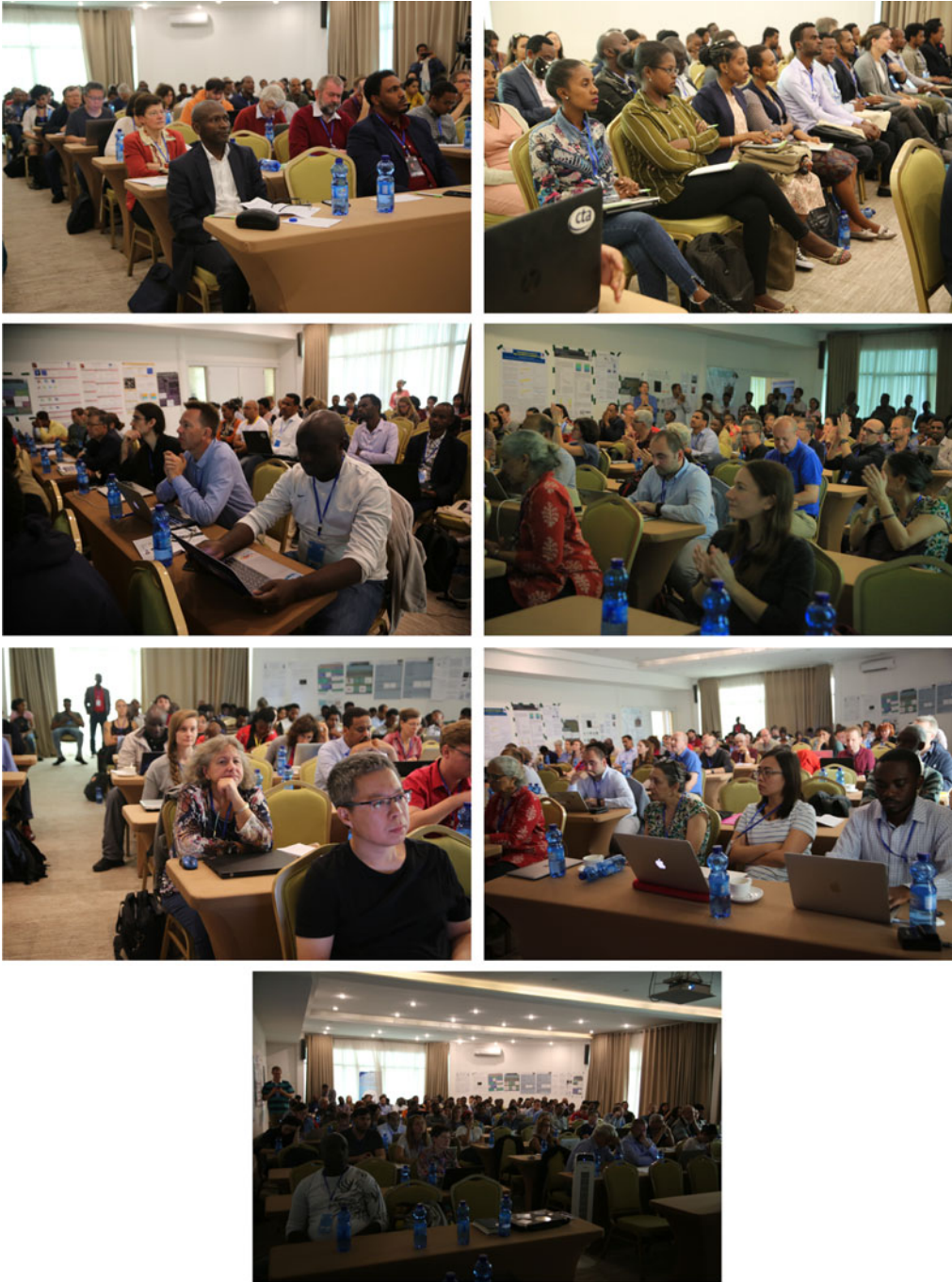
Figure 2. IAUS 356 photos.