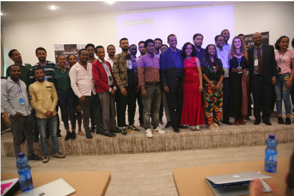
Figure 1. IAUS 356 LOC and supportive staff.