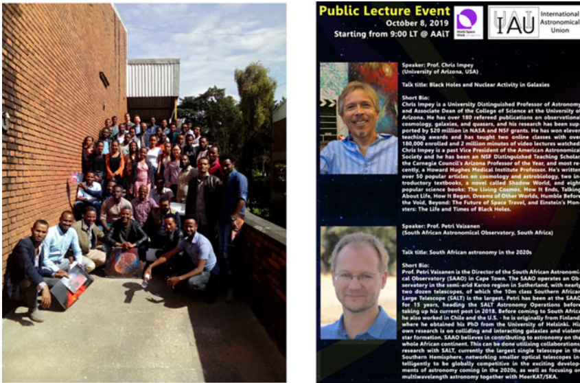
Figure 1. Left: Group picture from MSc/PhD students and young researchers training. Right: Poster with announced public talks.