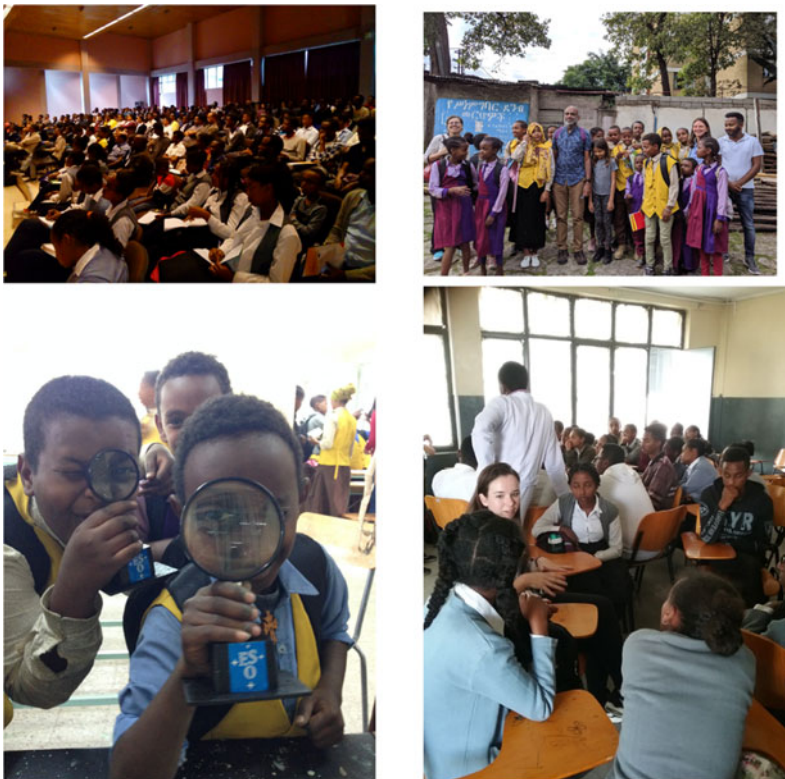
Figure 2. Top left: Group picture from AAU during public talks. Top right and bottom: Outreach activities in schools.