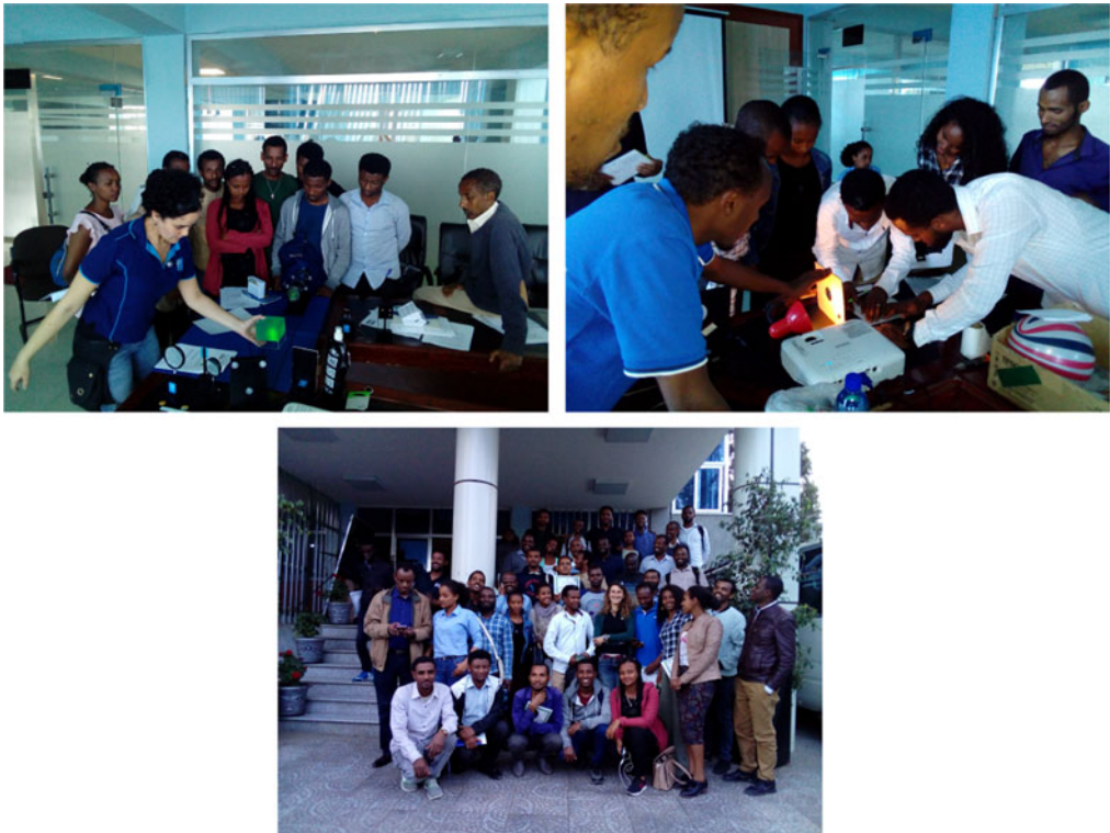
Figure 4. Pictures from school teachers training.

Saturday afternoon and Sunday the training was done in collaboration with the Network for Astronomy School Education (NASE), where experiments have been constructed using recycled and easily accessible materials for showing different physical and astrophysical laws. Three workshops were given by Dr. Mirjana Pović (ESSTI), related with solar spectrum and light, stellar properties and stellar lives, and expansion of the universe. Introduction to the virtual planetarium software ‘Stellarium’ and stargazing was given by Mr. Alemiye Mamo (ESSTI). Few pictures from the training can be seen in Fig. 4.