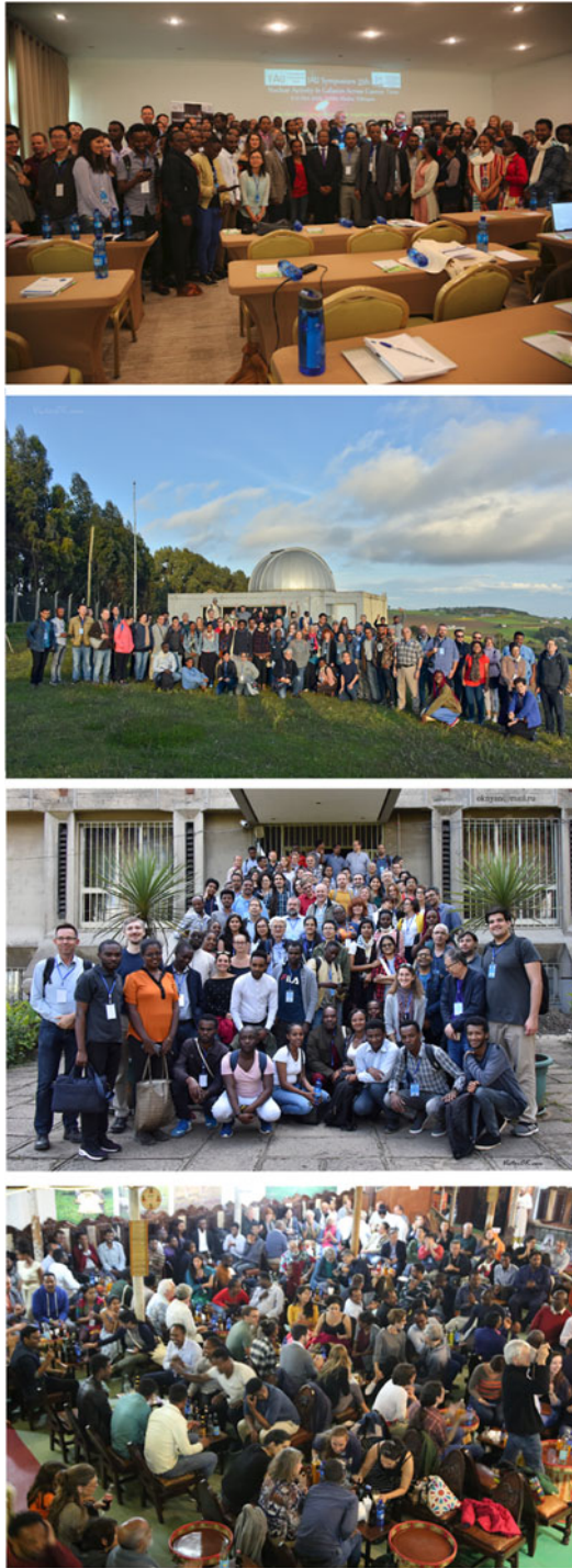
Figure 1. Group photos from the opening session, National Museum visit, Entoto Observatory visit, and conference dinner.

We would like to give our thanks to all participants for being a part of the IAUS 356.