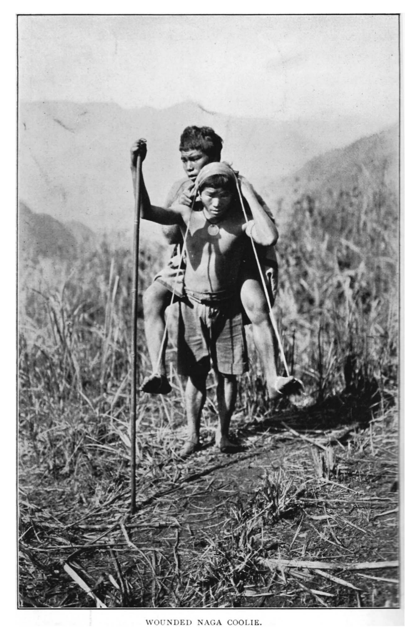
Figure 3. Coolie work could also include carrying other people, a load still heavier than the standard sixty pounds.