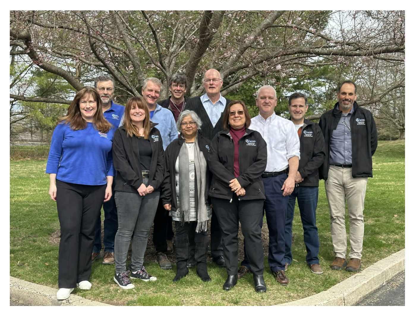
Figure 8. ICDD's 2024–2026 Board of Directors.