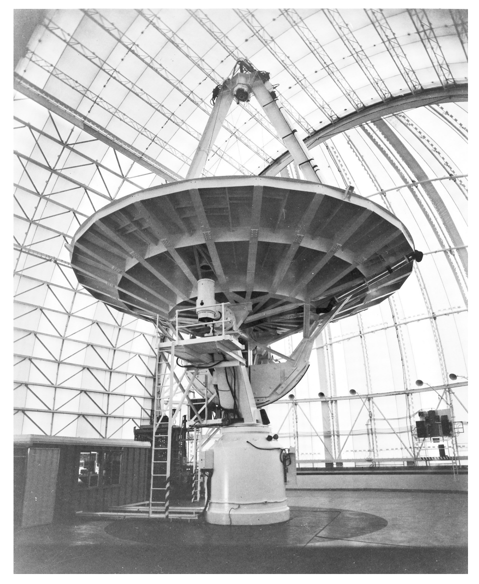
Figure 1.1 The NRAO 36 Foot Telescope in its fabric-covered astrodome on Kitt Peak, Arizona.

produce a remarkably strong radio signal. For the first time, astronomers could measure the physical properties of star-forming regions of space without their view being obscured by the interstellar dust clouds, allowing them to formulate theories of star formation based on observational data. Fifty years later, ALMA would continue to explore the potential of CO for star formation studies, not only in the Milky Way but in distant galaxies in the Universe.