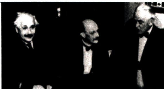
Max Planck center, with Albert Einstein and Robert A. Millikan, 1928.