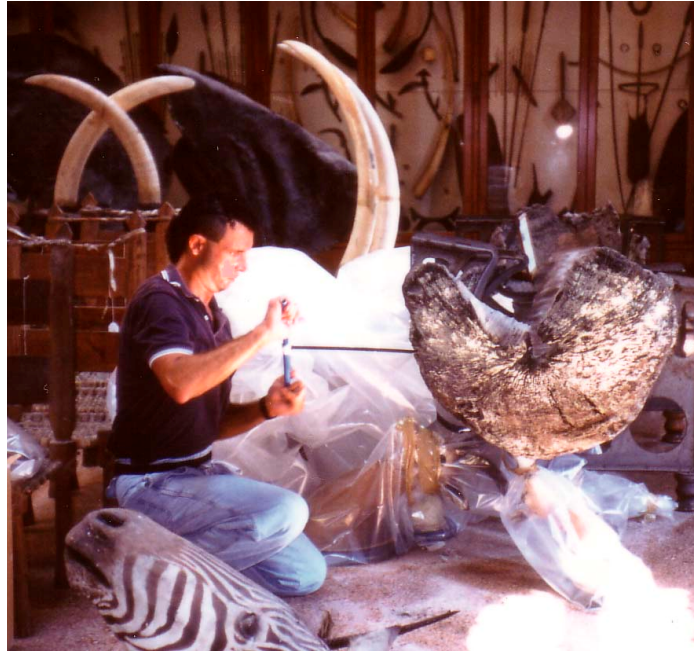
Figure 2 Sampling the logboat from Lova with a tree borer in the Museum of Natural History of Venice

Tree-ring analysis was carried out on almost all the boats in order to select the location with the outermost tree rings as samples for ^{14}\text{C} dating too, thus trying to avoid the “old-wood effect.” With 1 exception ( Zellina 1 ), due to its submerged condition, we obtained wood specimens from the outermost tree rings present on the vessels. 3 In only 3 cases (because of wood working) are they made of sapwood ( Boretto 1 , Eremitani 1 , and Eremitani 4 ), so some of the ages could be a little too old. Most samples for ^{14}\text{C} dating consist of small pieces (from 1.38 to 10 g) for accelerator mass spectrometry (AMS) or liquid scintillation counting (LSC) techniques, taken along pre-existing cracks or from cores extracted for dendrochronology. Some of the boats studied were only dried before dating and in other cases sampling was carried out before restoration, so no contamination should have affected the material.