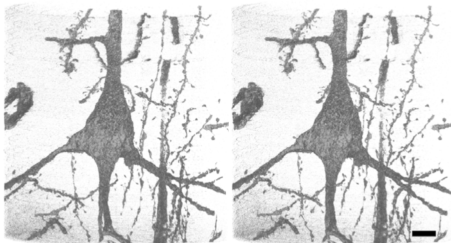
Figure 1. Stereo rendering of the three-dimensional structure of a pyramidal neuron and neuronal processes in the human cerebral cortex. Scale bar: 5.0 \mu\text{m} .

[5] This work was supported in part by Grants-in-Aid for Scientific Research from the Japan Society for the Promotion of Science (nos. 21611009, 25282250, and 25610126). The synchrotron radiation experiments were performed at SPring-8 with the approval of the Japan Synchrotron Radiation Research Institute (JASRI) (proposal nos. 2013A1384, 2014A1057, and 2014B1083).