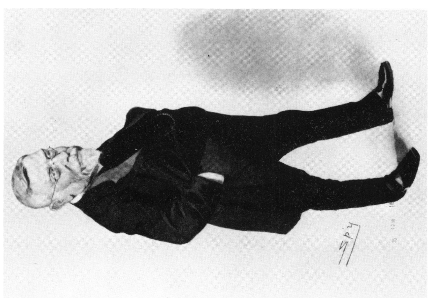
Plate 3: Barlow as royal physician. Offset lithograph after 'Spy', published in a supplement to Vanity Fair , 12 April 1906. Appointed a physician to the royal household in 1896, Barlow subsequently served as Physician-Extraordinary to three successive sovereigns.