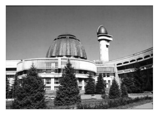
Figure 2. The Republican Palace of Schoolchildren.

and conferences of students. On behalf of International Space School of Baikonur, the Republican centre of academic methods in supplementary education (RCAMSE) received an offer to work together and undertake national and international events in the area of space education, using their base.