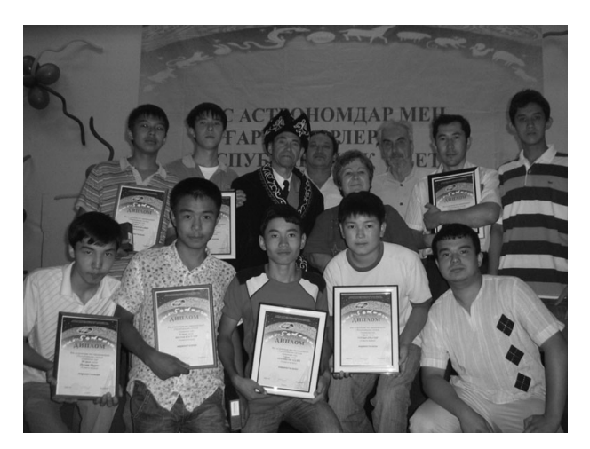
Figure 3. Participants and winners of the Republican Rally.

contribution to such problems can still be significant. During some 5-6 years students progressed from performing simplest exploratory tasks to a level where they set targets, develop approaches and perform research all by themselves. About 98% of members of PASS continue their education after high school choosing the same major, more than half of them continue scientific work upon completion of post secondary education.