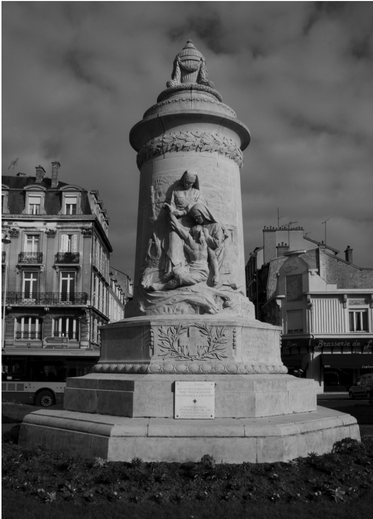
Figure 1.6 ‘Monument à la gloire des infirmières françaises et alliées victimes de leur dévouement’, Rheims, sculpted by Denis Puech, 1924.

a ‘call to arms for future nurses’ as she felt that the hopes of pacifists were illusory given her experiences in two wars against the same enemy. 64