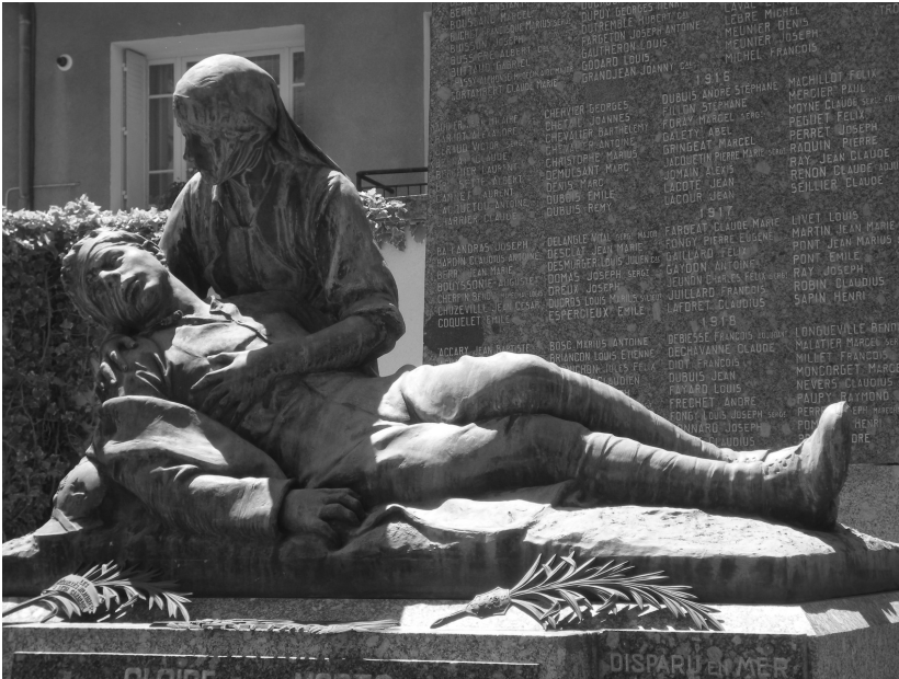
Figure 1.1 War memorial, sculpted by Christian-Henri Roullier-Levasseur, Charlieu (Loire), 1922.

understood in this context as an admirable example of an individual's fulfilment of civic or patriotic duty to the nation.