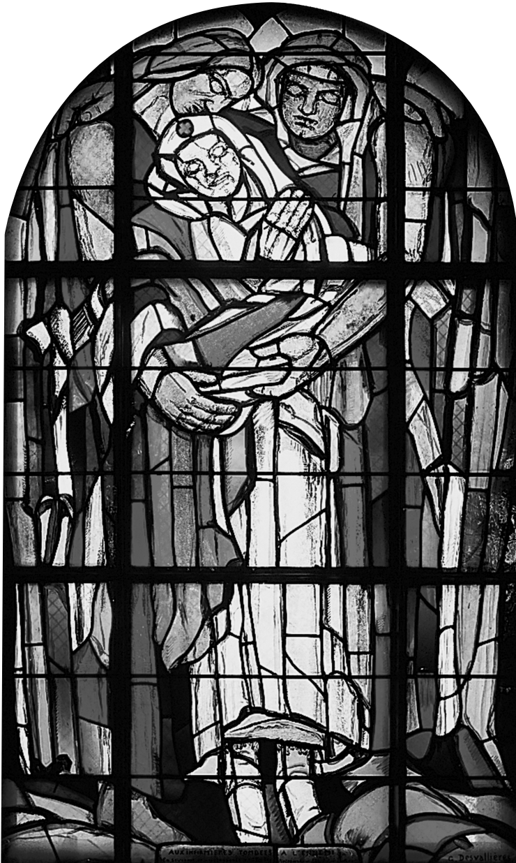
Figure 1.2 George Desvallières, Triptyque de l'Ascension, L'Infirmière , 1927. Stained-glass window, 230 × 140 cm (CR 1856, p. 484).