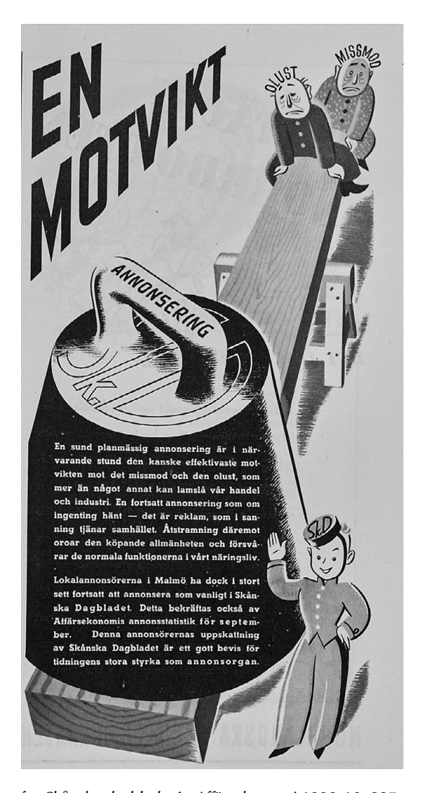
Figure 1. Advertisement for Skånska dagbladet in Affärsekonomi 1939:16, 995.

expressed it similarly: "Life goes on ... after all we are still consumers, our ways of living have not changed a lot—we brush our teeth like before, wash, dress, read ... consume." The weekly Hemmets journal also asserted that they had an important mission to fulfill: