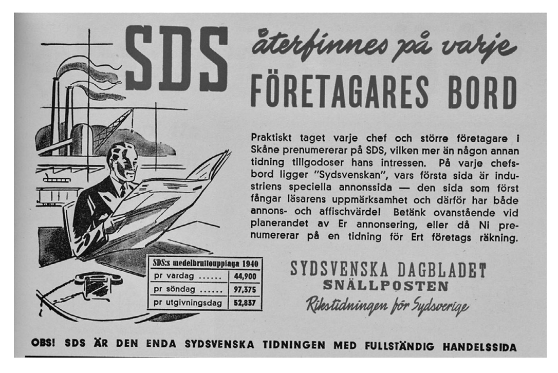
Figure 3. Advertisement for Sydsvenska dagbladet in Annonsören 1941: 4.

In the above quotation, it is clear how the social class was gendered as male-driven, but this also stands out as an example of how the family was attributed to increasing importance as a consuming unit during the war. The illustration shows the whole family waiting for the postman to deliver the newspaper, suggesting that all family members could be relevant as consumers. The well-off family was thus idealized rather than portrayed as affected by the war in the sense of curbed consumption and a drafted husband. <sup>58</sup>