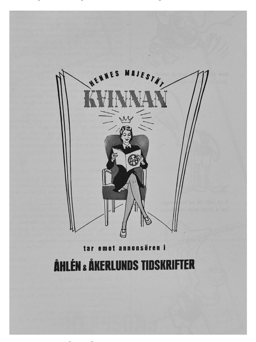
Figure 8. Advertisement for Åhlén & Åkerlund in Annonsören 1944: 11.

paper's Association surveyed housewives about how the war affected their relation to advertising. The results, published by Annonsören , showed that they appreciated advertisements more than before as sources of information in times of rationing and crisis. This only, however, on the condition that advertisements were reliable and truthful. A housewife in southern