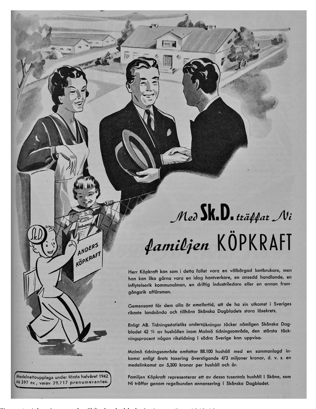
Figure 4. Advertisement for Skånska dagbladet in Annonsören 1942:10.

Agriculture needed to scale up to compensate for closed trade and the following increase in domestic demand. Publications in more rural areas therefore quite naturally claimed that their audiences were stable consumers during the war, and the countryside and especially farmers'