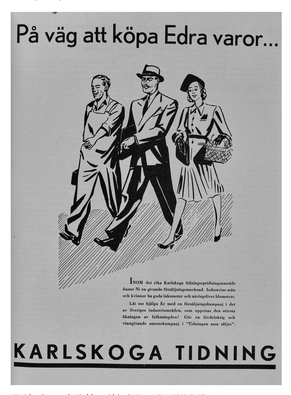
Figure 7. Advertisement for Karlskoga tidning in Annonsören 1943:6, 17.

by the homemaker, according to Törnqvist & Carlsson, without the help of servants. Advertising facilitated and made consumption more efficient they stressed; since women had studied the advertisements beforehand, they could save a lot of time not having to go from shop to shop to