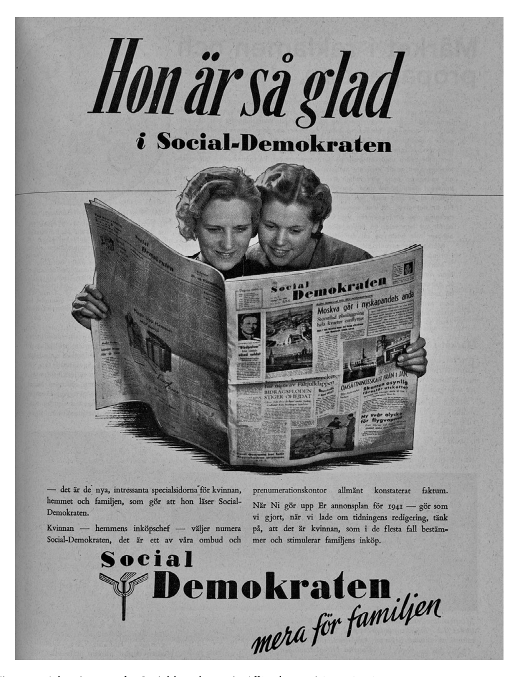
Figure 6. Advertisement for Socialdemokraten in Affärsekonomi 1940:18, 1039.

the Swedish labor newspaper version, there was more of a blurring of the working class and the mass market. Illustrated with a male worker in front of a machine, Västgöra-Demokraten for example asked: "Is He one of your customers?"<sup>92</sup> Similar advertisements portrayed more or