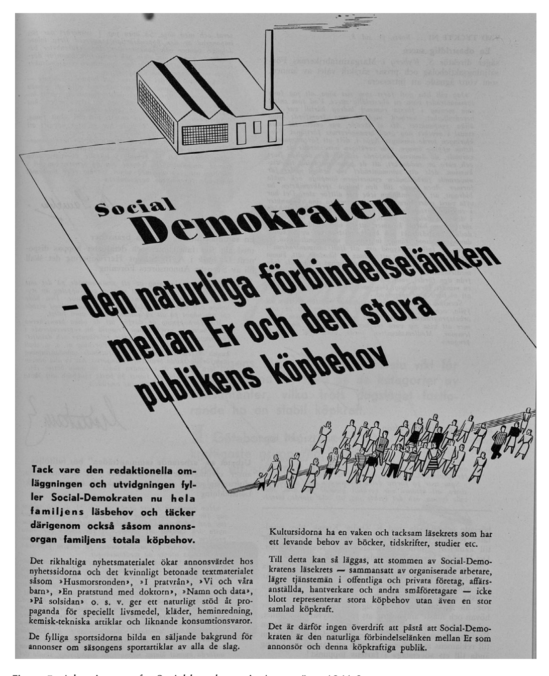
Figure 5. Advertisement for Socialdemokraten in Annonsören 1941:3.

advertisements for food, clothing, interior decoration, etc. were recommended. This suggests that not only the division of the press but also the departmentalization of the content of the newspapers was used as an infrastructure for segmentation. In the same advertisement, Socialdemokraten advocated that sports pages could be used for related products, culture