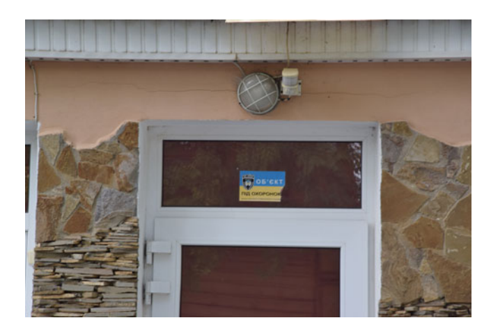
FIGURE 5. A hard to remove sticker in Ukrainian: 'The object is under protection', with the Ukrainian flag as a background, Yevpatoria.

Walls were one of the central battlefields in the proclaimed war against Ukraine as an ideological competitor of the Russian state. Walls of buildings, bus stations, façades; walls in museums, cafes, shops; walls of schools, state-governed institutions, libraries: all of them served as canvases for this ideological fight.