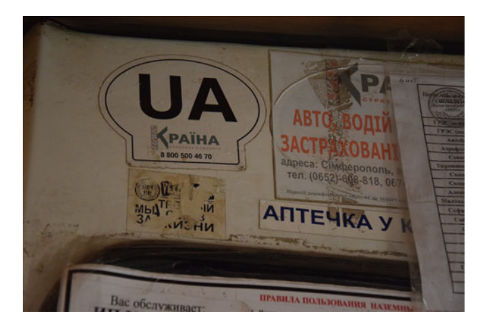
FIGURE 2. Layered stickers: 'Insured in Ukraine', Gvardejskoe.

certain traces, and not others, were due to the very specific research agenda I had to pursue. Whilst for many others, who lived in Crimea, life seemed to go on, for me, the history of Crimea was divided into 'before' and 'after' the annexation.