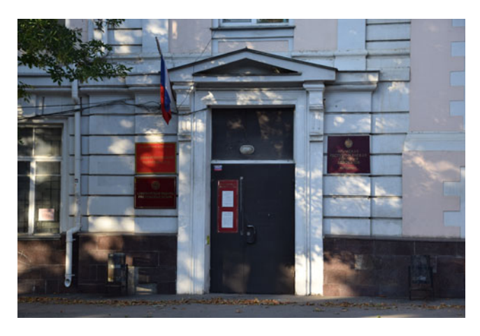
FIGURE 6. Simferopol's Rayon Court (top left), the Chamber of Advocates of the Republic of Crimea Simferopol (bottom left), the Crimean Association of attorneys (top right). Simferopol, September 2019.

four tiny holes left from the previously installed sign-plate (Figure 7). This evidence makes one wonder about 'what' has been erased, 'who' has erased it, as well as 'why' this erasure has taken place. Perhaps the newly installed signs to the right, as adorned with credentials of the Russian Federation, may hold the clue to this semiotics of produced absence (cf. Karlander 2019).