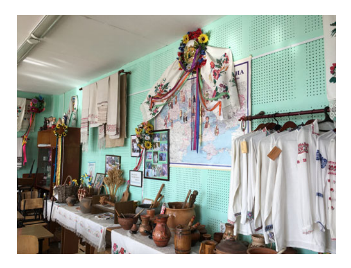
FIGURE 16. 'A Ukrainian classroom'. Simferopol, September 2019.

Ukrainian statehood on the peninsula, unless that statehood is considered to be unimportant. The analysis has shown that the past always remains present, visible, and audible: erasure does not simply negate Ukraine, and voids or shadows are not merely a matter of aesthetics. Rather, erasure leaves traces. Voids point at processes of silencing. Absences speak of violent acts.