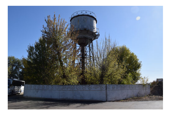
FIGURE 11. A wall. Gvardejskoe.

including the Ukrainian railway, but also the confiscation of private assets. Unlike in the previous examples, where the presence spoke of absence as the 'said' of the 'non-said' (Figures 9 and 10), here, the barely visible linguistic sign served as an entry point for the investigation of absences and presences in semiotic landscapes.