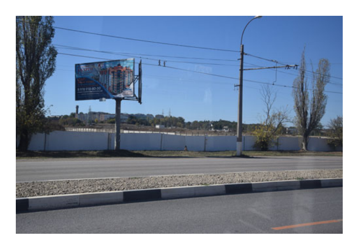
FIGURE 1. A blank wall which used to burst with colours. Simferopol, 2019. Reproduced with permission from the participant.

Petra was about to take a photograph of the pictures on the wall, as she had to establish that what she was searching for had already gone. The pictures had disappeared. But the blank wall (Figure 1) was still explicit in its clear denial of previous signs 'unwelcome' in this present space. Petra mentions the transgressive character