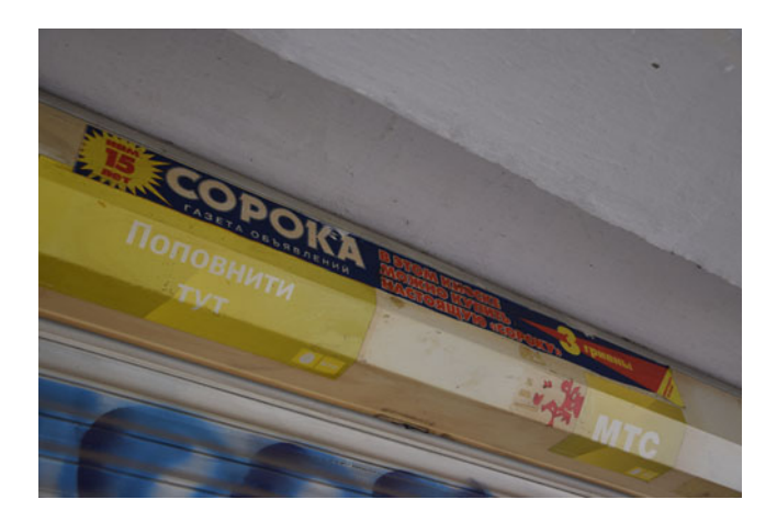
FIGURE 3. A tiny ad on the top of the stall written in Ukrainian: Ukrainian mobile operator MTS, Simferopol.

I was a very particular kind of non-distant observer. I felt acutely the injustices of this violation. Especially after having spent some time with my participants, I became alerted to the Russian insurrections on individuals' freedoms and an increased sense of isolation that followed the imposition of international sanctions. Intimidations, imprisonment, and death threats faced by people who thought and