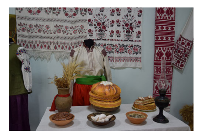
FIGURE 14. Museumized Ukrainian practices. A photo from the Ethnographic Museum, Simferopol. September 2019.

manages to avoid uncomfortable topics and omit the thematization of the contested status of Crimea. Such essentialized images of who 'the Ukrainians' are supposed to be creates a seemingly homogenous group, which is easier to be made into 'The Other'.