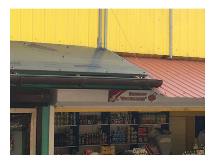
FIGURE 4. A sticker in Ukrainian: 'Kharkiv sausage factory', Simferopol.

spoke differently were among the symptoms of the Russian state' authoritarianism, which seemed to become a new norm in Crimea.