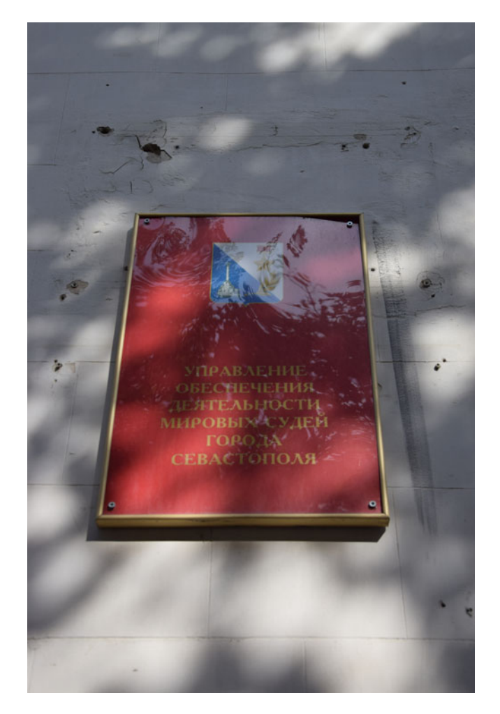
FIGURE 8. 'The Management of the Magistrates Court of the city Sevastopol', Sevastopol, September 2019.

In comparison to Figure 6, more visible and blatant traces of acts of erasure are evident here. The previously installed plates were ripped right out of the wall, leaving behind still visible anchors (wall plugs) and deep holes. Like Figure 6, in this photo the new and only recently installed sign-plate resonates with the traces of violence. Likewise, one can see the production of absence through erasure, that is, there are no attempts to hide these traces behind the layer of plaster or by producing a bigger sign-plate.