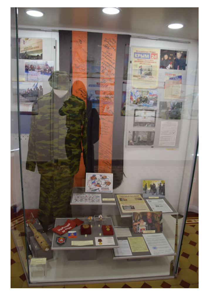
FIGURE 10. The evidence of 'how it all was'. Central Museum of Taurida, Simferopol.

For me, the corridor space of this fabricated exhibition felt abhorrent. Against this backdrop, the absence of Ukraine was even more acutely present. When attending the museum exhibition, I was struck by the degree of 'naturalness' with which the Ukrainian present has been silenced. I felt the complicity of these walls in serving another function, in serving as a canvas for other stories. They did not just carry the new images, the new inscriptions, but almost provoked a panic attack.