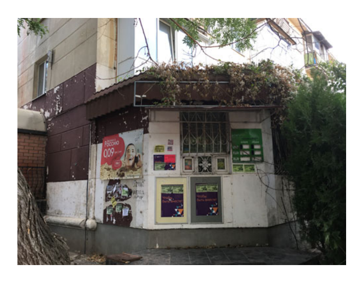
FIGURE 13. 'Nationalisation' of Ukrainian property. Yevpatoria, September 2019.

Figure 13 depicts the remains of a closed and obliterated currency exchange kiosk previously run by the Ukrainian bank, PrivatBank. Like other Ukrainian assets, here, the PrivatBank property was appropriated (or, as it is put in Russian, 'nationalised') by the Russian government and transferred to Russian banks, including the RNKB bank. Bright advertisements and other promotional materials