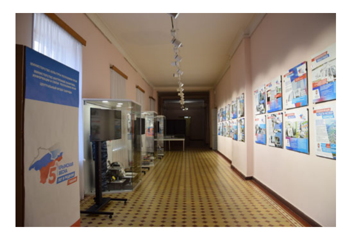
FIGURE 9. The corridor-space of the exhibition '5 years in the native harbour' at the Central Museum of Taurida, Simferopol.

The exhibition about 'the accession' and 'the Russian spring' (Figures 9 and 10) followed by the Crimean occupation intended to bring to light the development of events preceding the so called 'Crimean referendum' in March 2014. It aimed to demonstrate remarkable changes taking place in Crimea, especially in terms of economic investments as well as infrastructure and security developments. The exhibition sought to educate the public by creating an appeal through emotionally charged figures, utilising images of children who are holding the Russian flag in celebration. The photographs of old fragile people—like the pensioner sitting in a wheelchair who, although apparently 100 years old, still managed to cast his vote in support of 'Russian' Crimea at the referendum (Figure 10)—attempt to convey a message of widespread popular support.