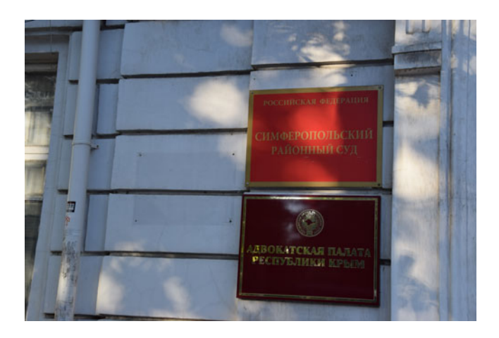
FIGURE 7. Signs of erasure (enlarged Figure 6).

The next photograph (Figure 8) was made during my trip to Sevastopol. This town has a special status as the headquarters of the Russian Black Sea fleet. The photograph depicts the Management of the Magistrates Court of the city of Sevastopol (registered 06.03.2015).