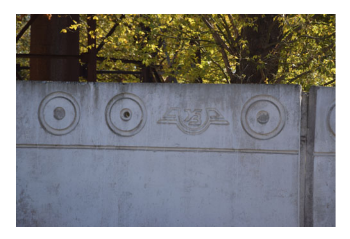
FIGURE 12. V3 'UZ', Ukrainian Railways (enlarged Figure 11).

One can only speculate as to why this had NOT been erased: was it maybe because the sign was in stone, or that it was situated in a peripheral or unattended space, barely noticeable by less attentive observers? Or was it simply forgotten? When treated as an ethnographic trace, this sign unequivocally points towards the presence of historically delineated pasts of the Ukrainian statehood in Crimea. That is, the