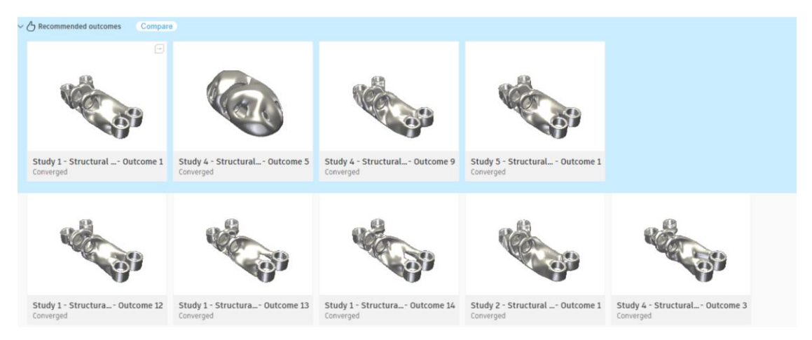
Figure 1 Generative design outputs of a GE bracket optimized for weight created using Autodesk Fusion 360 generative design.

Generative design tools have more recently been shown to also be useful in early design process stages. Sketches developed by deep learning generative design tools have been found to be functionally comparable to simple line sketches created by human designers and therefore have the potential to aid designers in brainstorming and ideation (Lopez et al., 2018). Research on the application of generative design and topology optimization tools in early stage design in an industrial case indicates designers adopt a different way of thinking to define the design space (Vlah et al., 2020). Computational tools have also been used to develop parametric models to generate designs with desired shape grammars, defining the aesthetics of the product in early stages of development (Alcaide-Marzal et al., 2020).