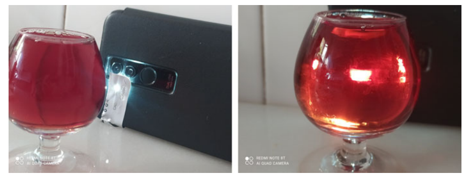
Figure 5. a) The glass of goblet with a liquid inside and the light of the mobile phone b) Images multiplied where the central light appears in other places in a shape similar to a cross or a ring (the central light is actually not possible to observe when the deector is an opaque body).

be observed near the Sun is an evidence of the action of the Sun on space, the Sun is acting as a gravitational lens (Ros, 2008).