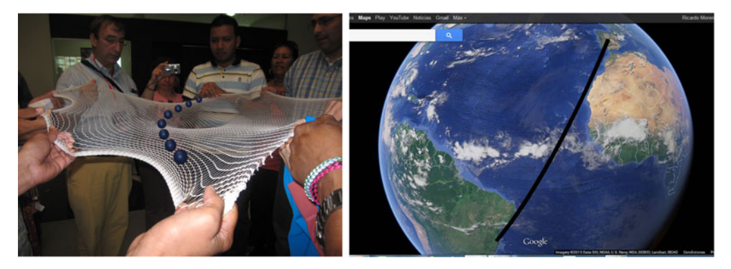
Figure 1. a)The path of a ball on a curved surface is not a straight line b) The path between two points on the globe is a curve.