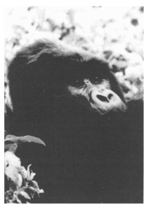
Actual size 22"×17½" * Full colour * Quality paper. Posters, Cards and Educational Displays.