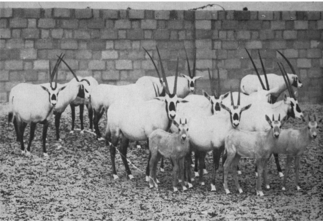
Plate 5. BREEDING HERD IN ARABIA. Part of the fine herd of Arabian oryx at the farm of HH Sheikh Qassim bin Hamad al Thani, Minister of Education of Qatar, Arabian Gulf. Sheikh Qassim, who kindly sent this photograph to the FPS, has accepted the position of Chairman of the Survival Service Commission's Arabian Oryx group. The FPS keeps the stud book for the Arabian oryx.