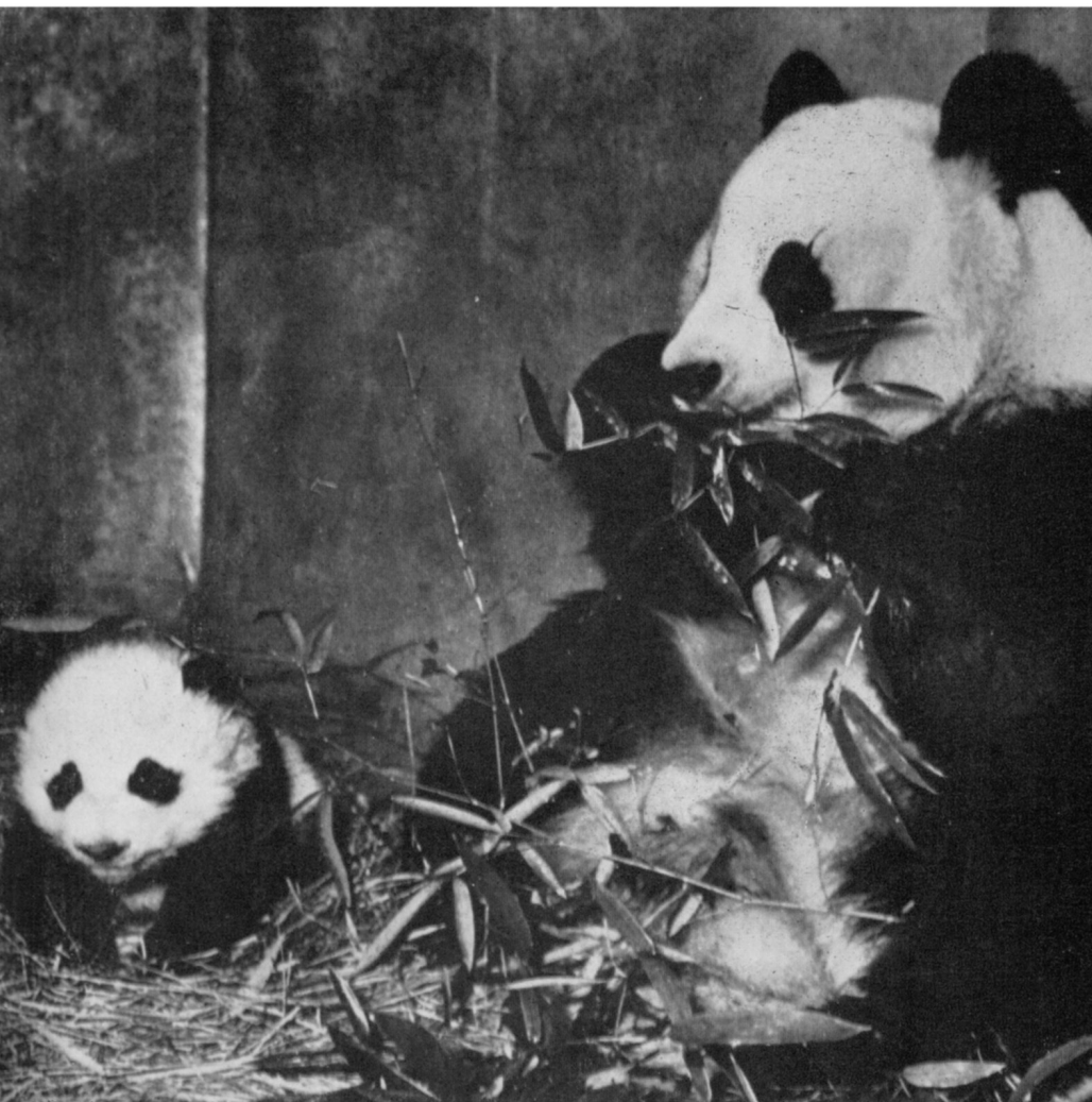
Plate 6. MOTHER AND CHILD IN PEKING ZOO, the only zoo in the world to have bred giant pandas. World Wildlife Fund