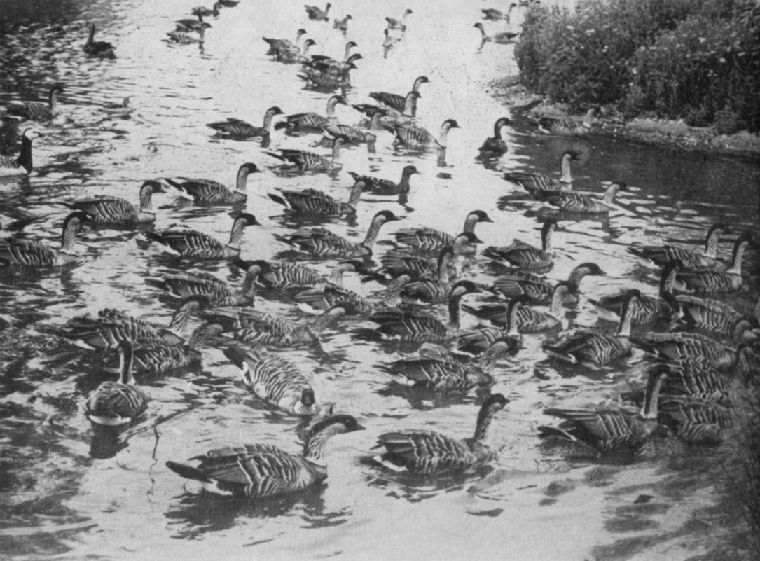
Plate 9. NE-NES BRED BY THE WILDFOWL TRUST. Some of these birds have now been flown to Hawaii, where the species was almost extinct, and released in the wild. Philippa Scott