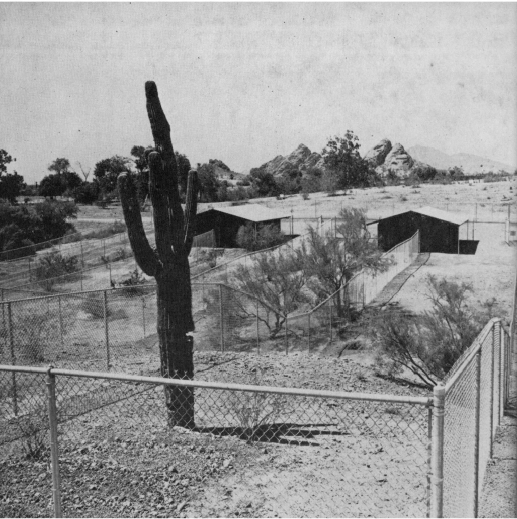
Plate 3. ORYX PENS AT PHOENIX ZOO, ARIZONA, the home of the World Herd. These pens were specially built for the animals captured in Operation Oryx. The herd now numbers 16 animals, seven of which have been born here.