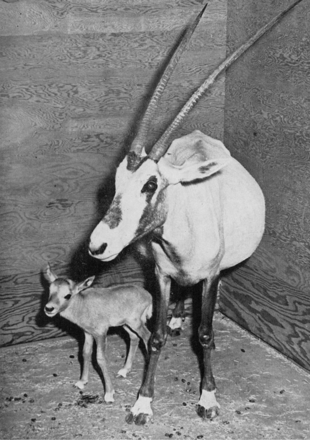
Plate 4. THE FIRST FEMALE CALF in the World Herd at Phoenix Zoo by Barr September 1966. Arizona Zoological Society