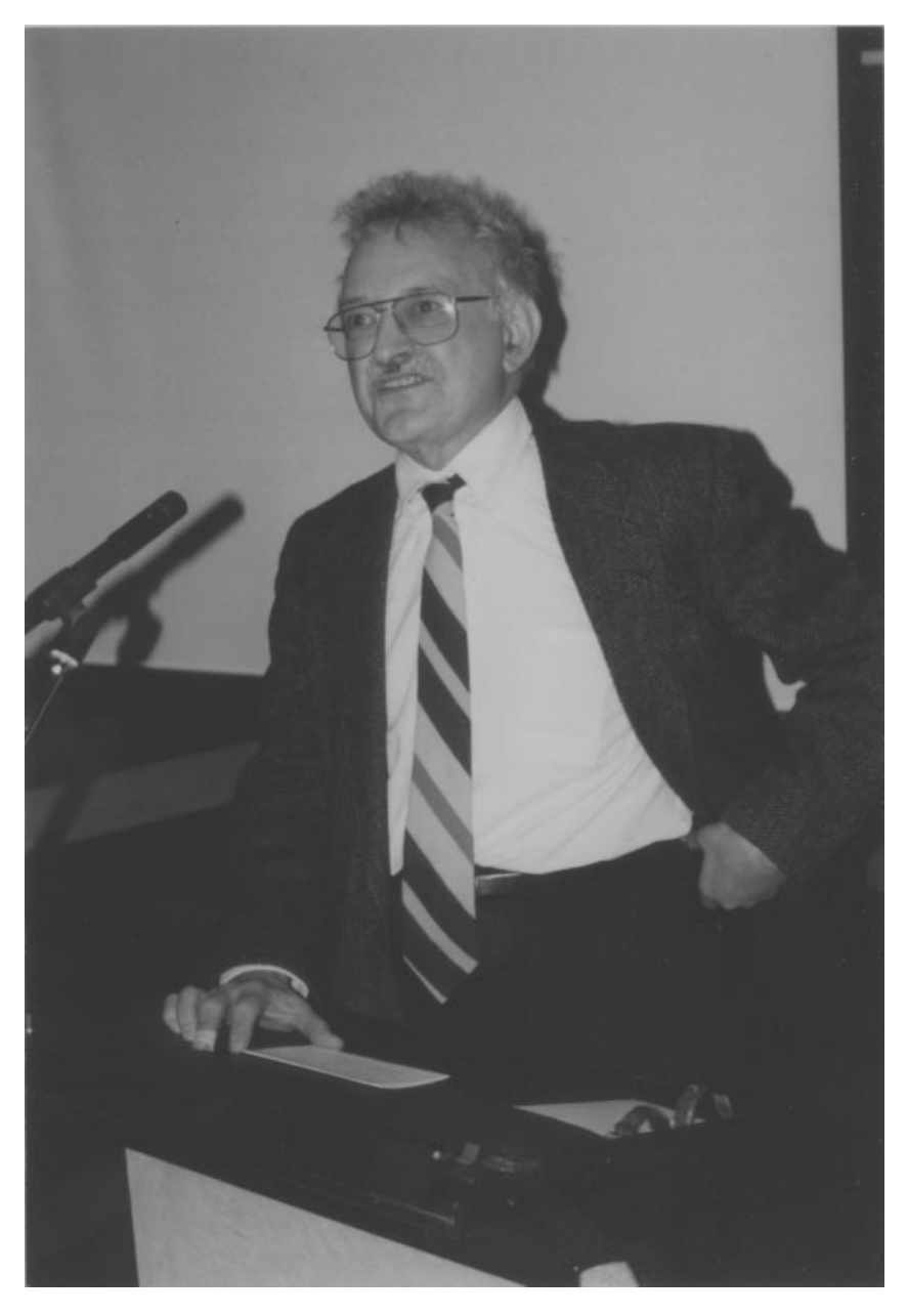
Figure 1. Immanuel Wallerstein, giving a lecture at the International Institute of Social History, as a part of the lecture series accompanying the conference "European Left Alternatives to Neo-Liberalism", 6 February 1996.