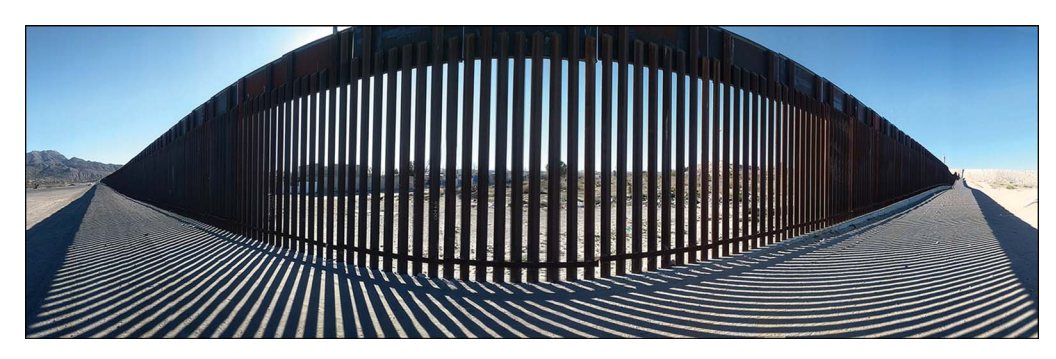
Figure 4. US/Mexico border wall between Sunland Park, New Mexico, USA, and Anapra, Chihuahua, Mexico (image by D. Lyon, January 2019, via Wikimedia Commons, under CC BY-SA 4.0 licence: https://creativecommons.org/licenses/by-sa/4.0).

by dogmatic, partisan politics within the USA. Indeed, the material reality of the US/Mexico wall has receded as its (mis)perception as a hard border has been magnified through political debate. This misalignment of the physical and imagined qualities of the border is akin to the situation on Hadrian's Wall, where the complexity of the material remains and their significance are simplified in popular and political discourse.