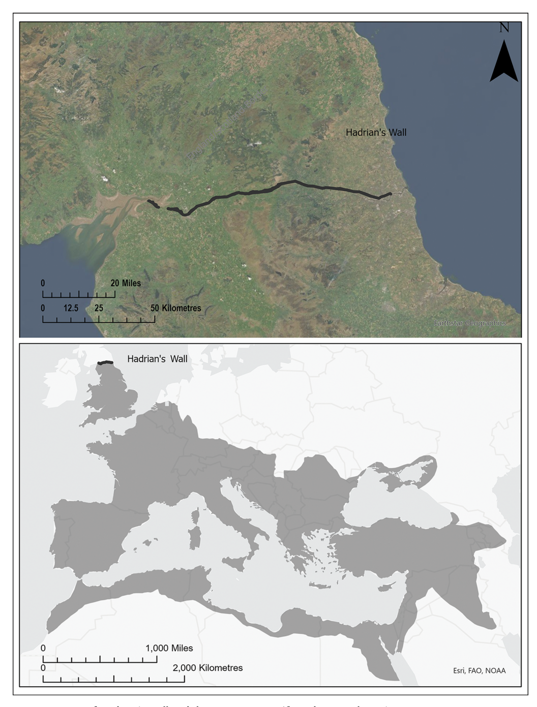
Figure 2. Maps of Hadrian's Wall and the Roman Empire (figure by B. Buchanan).

note that "the broader task of public archaeologies of frontiers and borderlands is an as-yet largely unexplored field", and one that must be developed. This is particularly pressing in the context of the development and reliance on hard boundaries—often demarcated by