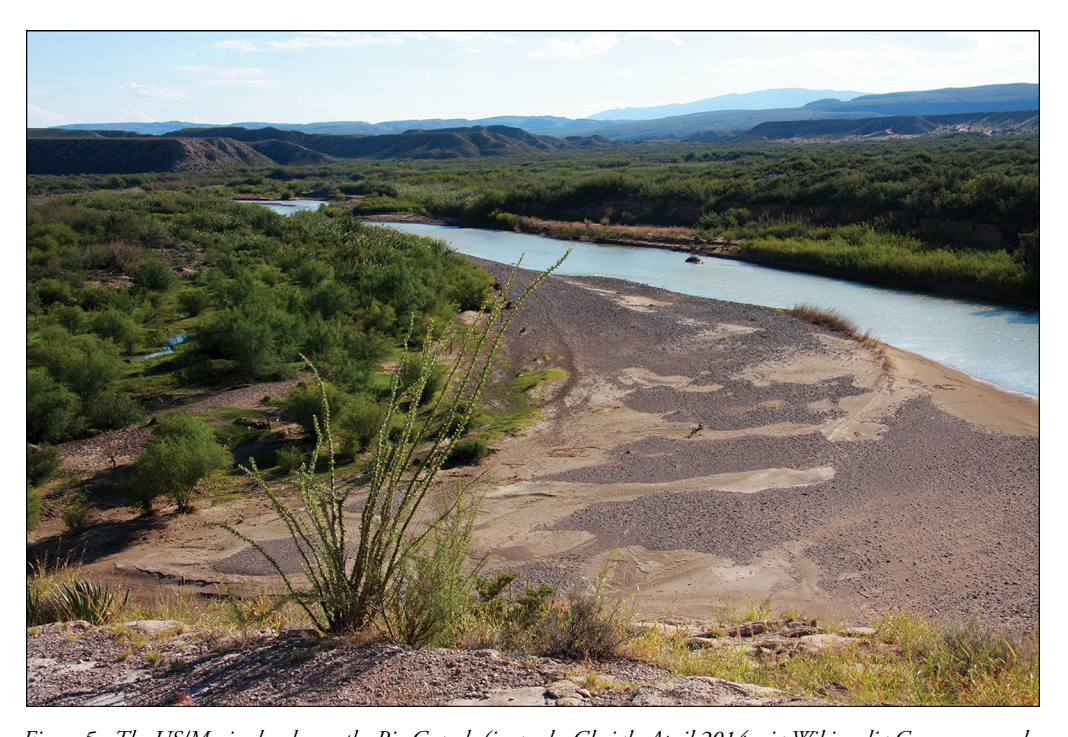
Figure 5. The US/Mexico border on the Rio Grande (image by Glysiak, April 2014, via Wikimedia Commons, under CC BY-SA 4.0 licence: https://creativecommons.org/licenses/by-sa/4.0).

Archaeologists studying the landscape of the US/Mexico border have consistently recognised the potential humanitarian impact of their research. McGuire (2013: 467–68)