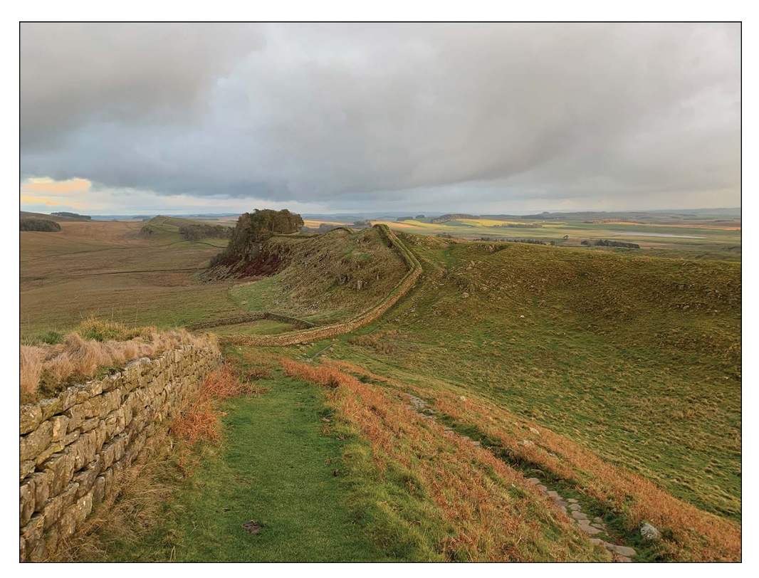
Figure 1. Photograph of part of Hadrian's Wall, near Housesteads, Northumberland.

the UK and the USA. Commentators from across the political spectrum, for example, sought to compare former President Trump's efforts to build a wall along the US/Mexico border with Hadrian's Wall (Flynn 2019; Jenkins 2019). Writing for the New Yorker on the eve of Trump's inauguration, de Monchaux (2016) remarked that: