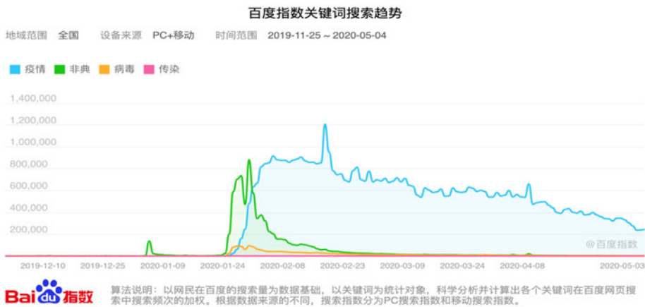
Figure 1. Frequency of coronavirus-related search on China's internet (Baidu Index search, December 1, 2019–April 20, 2020)