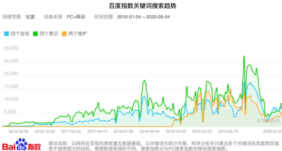
Figure 4. Frequency of search on news headlines related to political loyalty and following the party line on China's internet (Baidu Index: May 2016–May 2020)