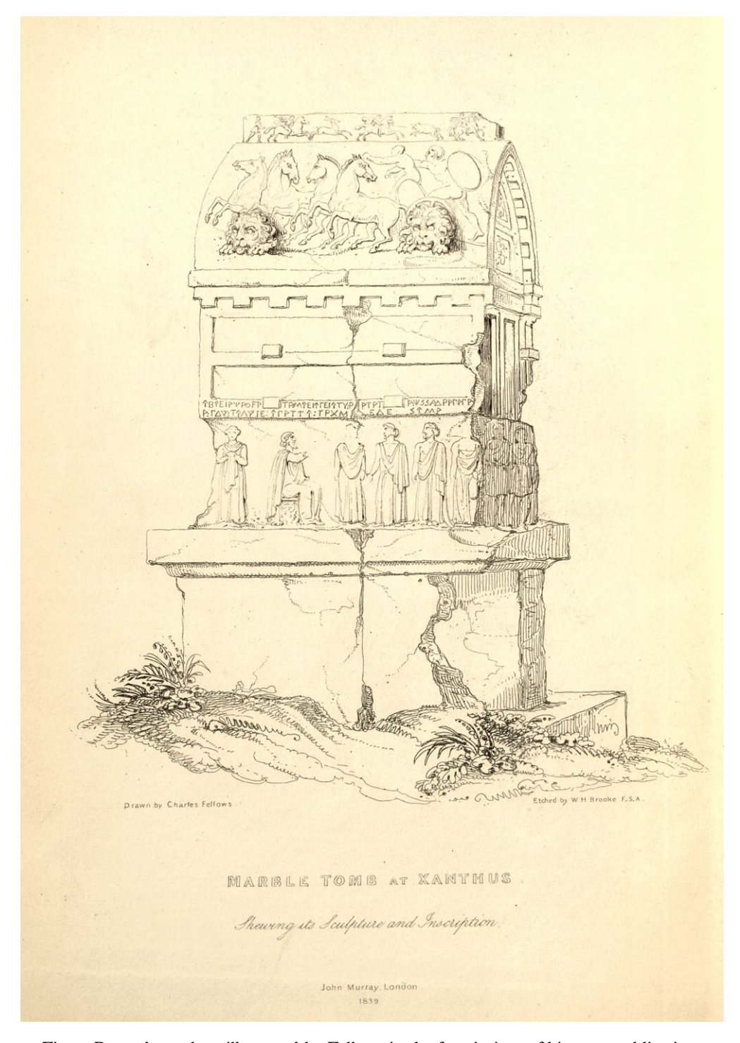
Fig 2. Payava's tomb as illustrated by Fellows in the frontispiece of his 1939 publication.