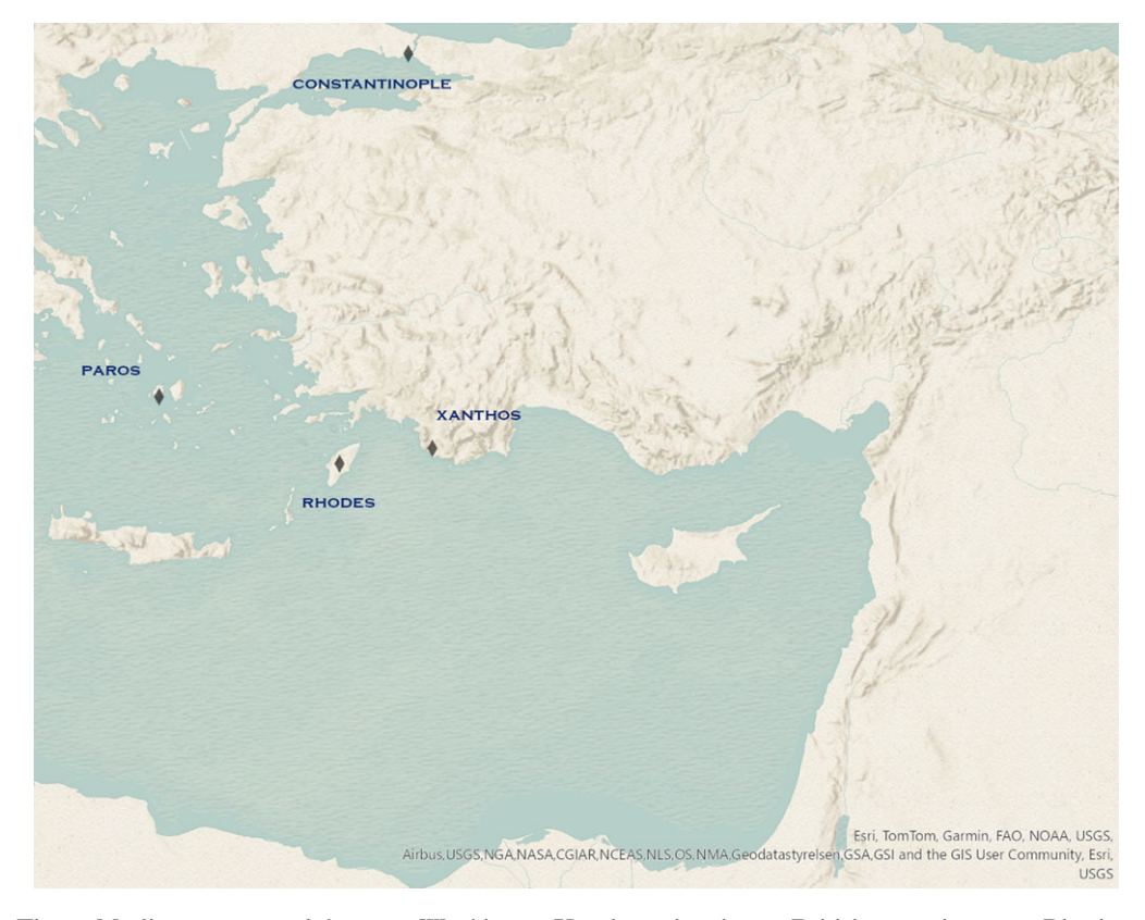
Fig 1. Mediterranean and Aegean. Working at Xanthos, the closest British consul was on Rhodes. Map: by the author.

bring attention to some of the vital contributions made to the development of archaeology by people of professions that posterity has seldom associated with intellectual pursuits. Before embarking on the narrative of the first Xanthos expedition through previously unexamined archival material, this paper will address the imperial context necessarily bound up in a government-backed expedition and consider where the Xanthos expeditions fit into nineteenth-century archaeology.