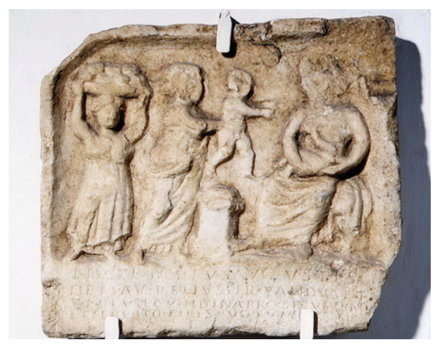
Figure 1.3 Nutrices Augustae relief (PMPO, RL 978), held in Pokrajinski muzej Ptuj Ormož<sup>57</sup>

happening simultaneously, or even present a particular 'snapshot' of more extensive ritual proceedings.<sup>58</sup> However, it is possible that the iconographic variations observed on Nutrices reliefs may reflect the diversity of ritual experiences. Within the cognitive sciences an individual's mind and their autobiographical memories are understood to be situated and extended into the environment which surrounds the individual. Since autobiographical memory is selective and finite (i.e. individuals can retain only so much information and are not able to encode and recall every detail of what they