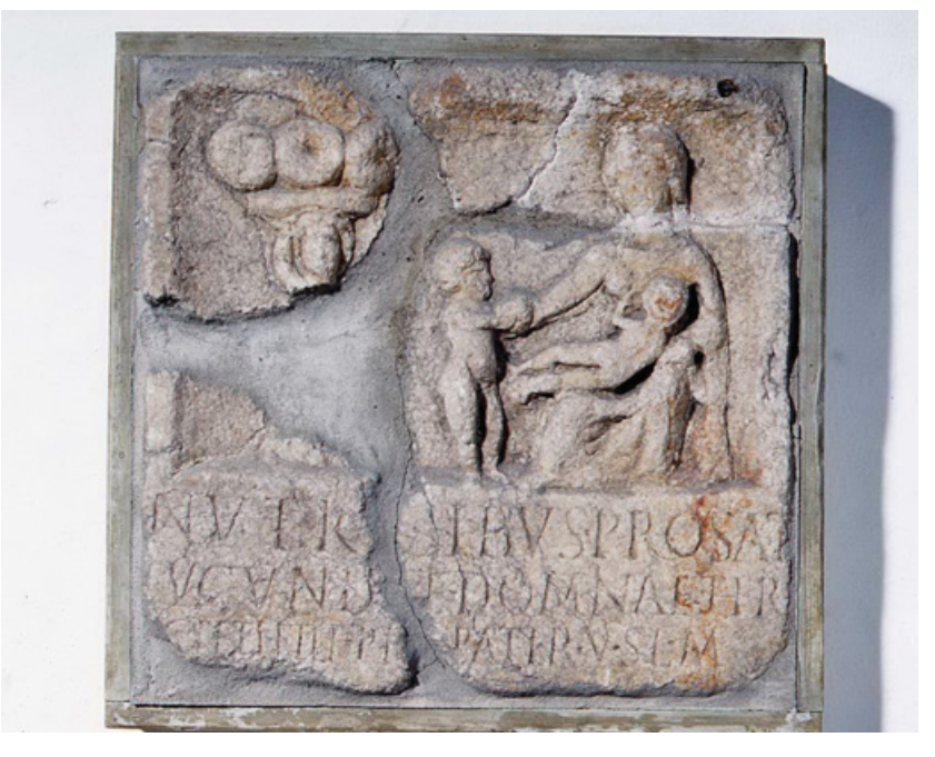
Figure 1.4 Nutrices Augustae relief (PMPO, RL 82), held in Pokrajinski muzej Ptuj Ormož<sup>59</sup>

perceive), an individual's environment therefore serves to extend and 'scaffold' their memories and cognitive processes.<sup>60</sup> This environment (e.g. places, objects, people, and events) can be imbued with mnemonic cues which can 'trigger' within the individual memories of past experiences. For example, students use course notes to remember past lectures and mixologists keep track of drinks ordered by making use of different cocktail glasses.<sup>61</sup> However, the environment which surrounds an individual is not a mere passive holder of offloaded memories; through active engagement and re-engagement with their changing environment an individual's cognitive processing and their memories can be reshaped. In