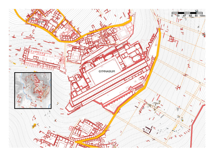
Figure 5.1 Plan of the gymnasium of Pergamon in relation to adjacent monuments and current reconstruction of street grid.