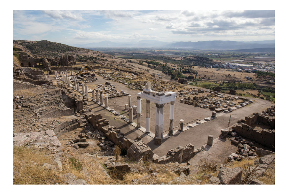
Figure 5.2 Gymnasium of Pergamon, looking east across the palaistra of the upper terrace (courtesy of Pergamon Excavation of the German Archaeological Institute; photo: Ulrich Mania).