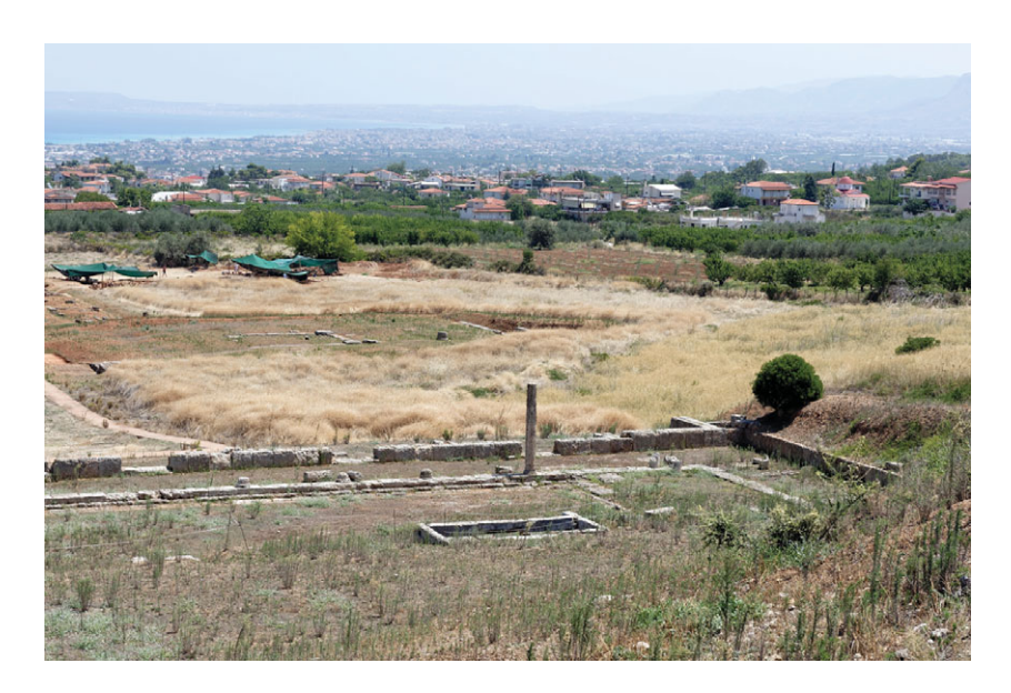
Figure 5.3 Hellenistic Sikyon, view east/southeast from the terraces of the city's gymnasium toward the adjacent agora.

Old and New City. The terraced complex was highly visible, both from the plain below and beyond Eumenes' walls, and along the axes of major streets that terminated at the structure's two original gates. Indeed, the more impressive of the two gates, the western, contains a covered staircase, which is rotated toward alignment with the streets of the East Slope. Building on the work of Bielfeldt, Pirson singles out the Pergamene gymnasium as a rare and singularly monumental civic space in the royal capital.<sup>206</sup> Yet as these and other scholars have noted, the citizens of Pergamon remain invisible or anonymous in the epigraphy and archaeology of the gymnasium until the final years of the dynasty. Only under Attalos III did the demos begin to dedicate statues in the gymnasium and gymnasiarchs to receive honors.<sup>207</sup> The architecture itself conflicts with any straightforward characterization of Eumenes' gymnasium as open to every citizen of