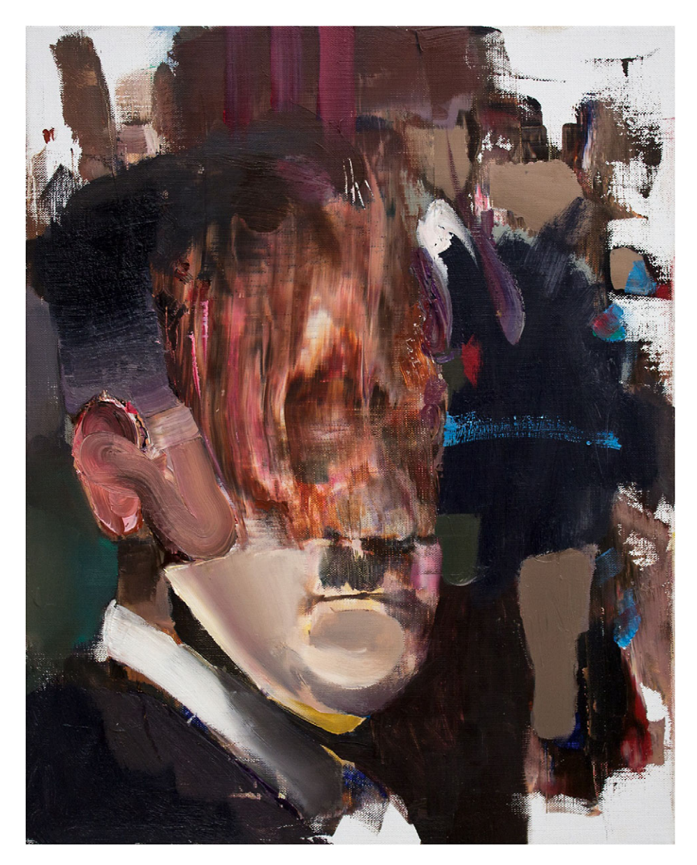
Figure 5: Adrian Ghenie, Untitled, 2012, Oil on Canvas, 50.5 × 40 cm Note. Photograph by the artist. Courtesy of the artist.

oppression. Ghenie meticulously dissects the alienation and fragmentation wrought by the digital age, portraying the human figure as entwined with and trapped by technology. His paintings vividly encapsulate the sense of isolation that digital devices engender, despite—or perhaps because of—their promise of connection and community. Ghenie articulates a profound disjunction between the physical self and the digital persona through distorted, sometimes grotesque representations of the human form (Figure 7).