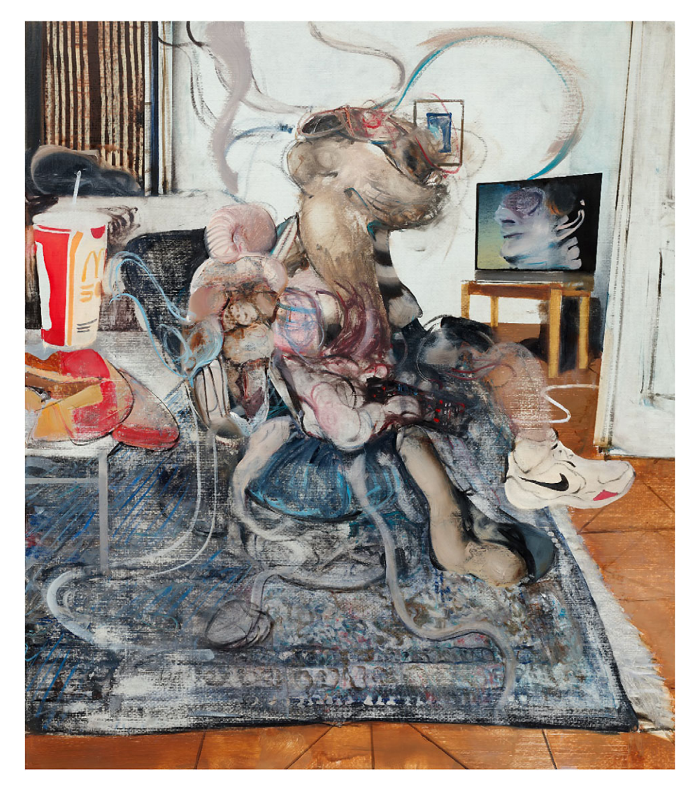
Figure 4: Adrian Ghenie, Figure with Remote Control , 2022, Oil on Canvas, 205 × 178 cm Note. Photograph by Jörg von Bruchhausen, Courtesy of the artist.

The exhibitions, Pie-Fights and Pathos and Darwin's Room , extend beyond mere artistic expression, delving into the dark corridors of twentieth-century totalitarian regimes, including the Fascist and Communist eras. His paintings, characterized by their haunting, distorted figures and layered, chaotic environments, serve as art and repositories of memory and reflection on the ethical dimensions of governance, political ideologies, and human cost (Figures 5 and 6).