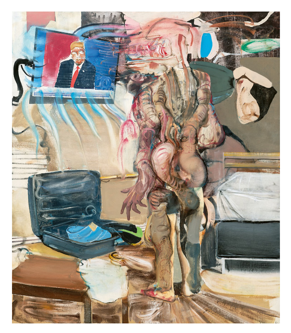
Figure 1: Adrian Ghenie, The Hotel Room , 2023, Oil on Canvas, 210 × 180 cm Note . Photograph by Jörg von Bruchhausen. Courtesy of the artist.

liberation, it also imposes new forms of confinement and oppression. This exhibition reveals how modern devices, while ostensibly designed to connect, paradoxically propagate a profound sense of disconnection and alienation. Ghenie harnesses the power of visual metaphor to express the nuanced dynamics between humanity and technology. His works in this series are particularly telling, depicting human figures that are at once familiar and deeply estranged. The distortion and fragmentation of these figures stand as poignant metaphors for the fragmentation of self in the digital age. The Hotel Room (Figure 1) embodies this thematic undercurrent with striking clarity, presenting a lone figure absorbed by the glow of a television screen, the