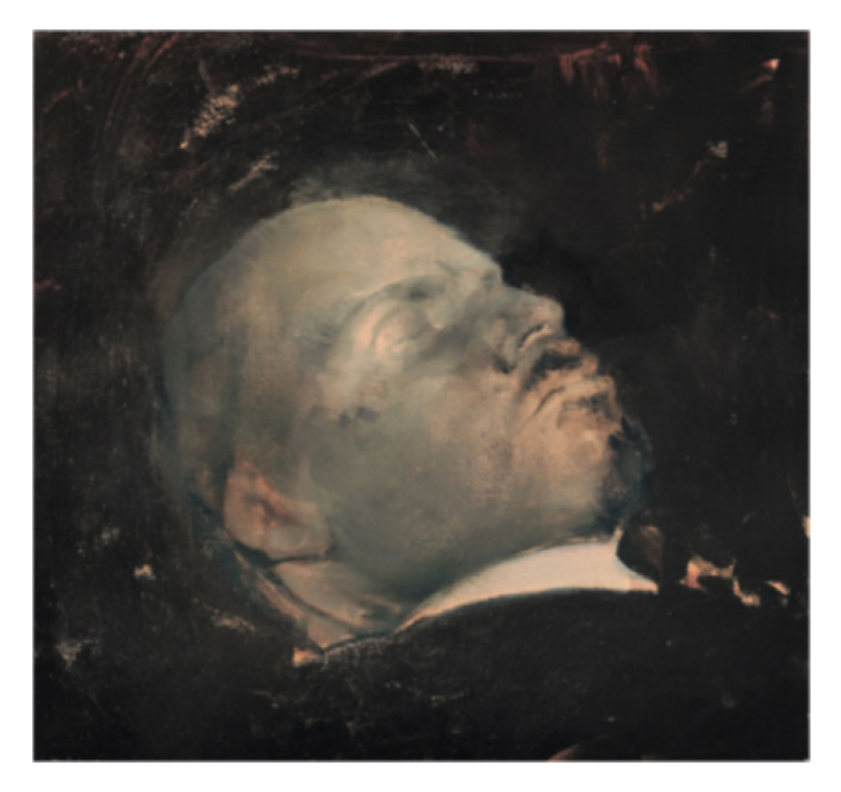
Figure 6: Adrian Ghenie, Turning Blue , 2008, Oil on Canvas, 30 × 31.5 cm Note. Photograph by the artist. Courtesy of the artist.

Beyond the immediate experience of alienation, Ghenie's work probes the complex web of corporate responsibility and ethical dilemmas inherent in technological advancement. Ghenie unveils a critical narrative that questions the motives and consequences of relentless digital innovation by drawing connections between consumer culture, corporate interests, and individual autonomy. His art serves as a commentary on how corporations, in their quest for profit and dominance, often prioritize technological proliferation over the well-being of the individual, commodifying personal data, manipulating desires, and fostering dependency. This critique extends to the ethical quandaries emerging as technology becomes increasingly integrated into every aspect of human life, from social interaction to self-perception.