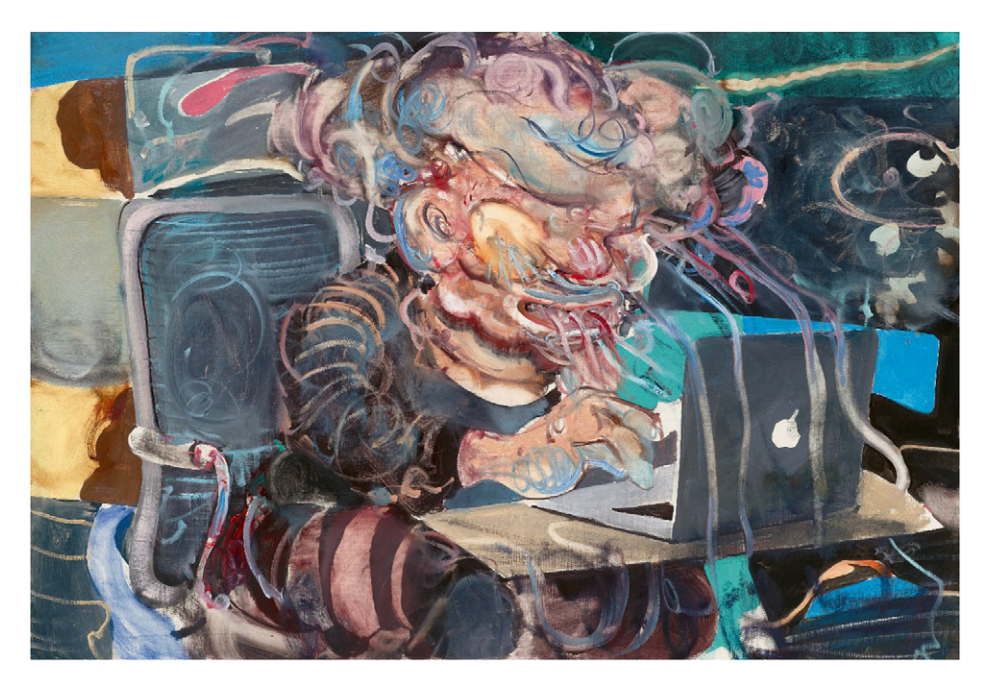
Figure 7: Adrian Ghenie, The Night Bird , 2023, Oil on Canvas, 105 × 155 cm Note . Photograph by Jörg von Bruchhausen. Courtesy of the artist.