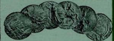
Gold Medal (Highest Award), Allahabad 1910.

GRANDS PRIX: Paris 1900, Brussels 1910, Buenos Aires 1910.