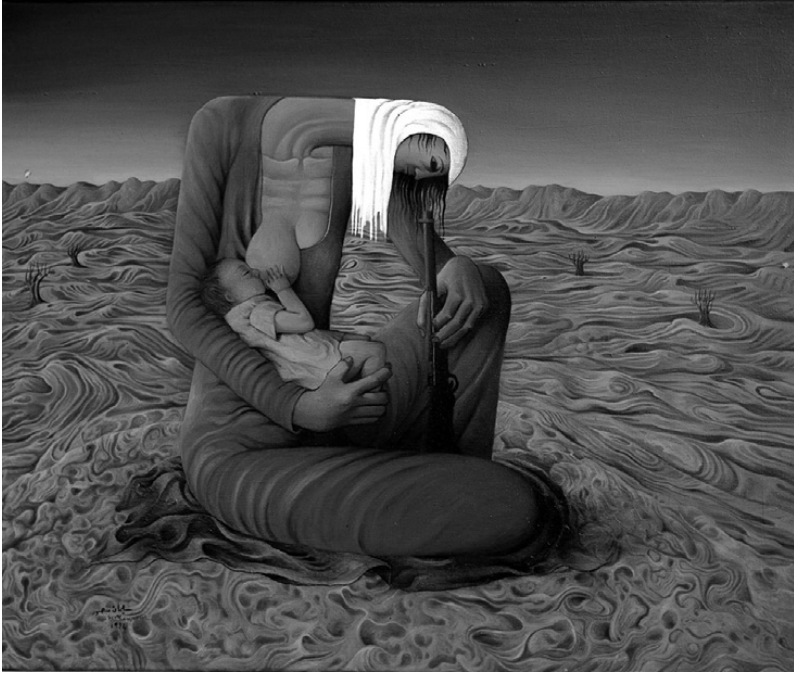
Figure 7.1 “Palestinian Motherhood” poster, Sliman Mansour, 1976. Used with the kind permission of the artist.

attributed to the late PLO leader Yasir Arafat. Research into the provenance of the first statement shared with me, “ Rahm al-mar'a al-`arabiyya huwa silahi al-aqwa ” (“The Arab woman’s womb is my strongest weapon”), invariably led me to Zionist sources. For example, the statement takes center stage in an August 2019 article by Yehuda Shalim published in the religious right Zionist newspaper Israel Today . 2 The article was translated and published in English- and Arabic-language venues, amplifying its message. I read it in Arabic translation in the London-based online newspaper Al-Quds al-`Arabi . Shalim repeats the “womb” statement putatively made by Arafat to editorialize about Palestinian Authority Prime Minister Muhammad Ashtiyia insisting that Palestinians are a majority “between the river and the sea” and thus Israel cannot continue to colonize Palestinian land. This claim,