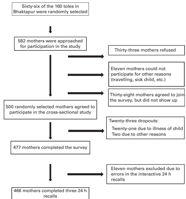
Fig. 1. Flow chart of the recruitment of the study subjects.

Women came to the hospital to receive physical examinations, dietary interviews and blood draws. The first woman was enrolled in January 2008 and the last in February 2009. The inclusion criteria were that they were lactating, had no