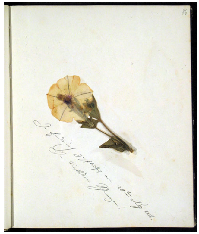
Fig. 5 Petunia from the garden at Endenich, Blumenbuch für Robert, 28 July 1856.<sup>76</sup>

artistic and poetic representations. As the above quotation from an 1858 letter by Schumann's trans-Atlantic contemporary Emily Dickinson expresses succinctly, flowers have the ability to communicate something yet also conceal much in their symbolic disobedience. Yet here at the end of the Blumenbuch für Robert and at the extremes of grief, Schumann attempts to control this disobedience by overwhelming the flower with her projected feelings. The posthumous dedication of the Blumenbuch to her husband is similarly a paratextual action that can be seen as an attempt to transform this multi-voiced and polysemic collection into a funeral wreath. Such actions, however, do not necessarily sentimentalize or contradict nineteenth-century floral symbolism. Rather, they show an awareness of how symbolically open flowers can be and their ability to convene on decipherable messages.