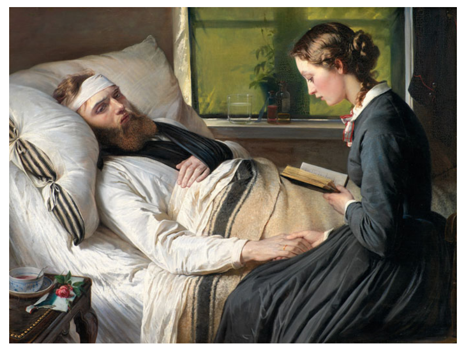
Fig. 2 Elisabeth Jerichau-Baumann, A Wounded Danish Soldier (1865), Statens Museum for Kunst, Denmark

painting similarly manages to gesture to some type of meaning while the posture of the woman depicted discloses little.