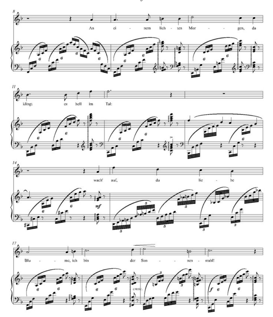
Ex. 2 Schumann, 'An einem lichten Morgen', Op. 23 No. 2, bars 8-20.

This conflation of flowers and women became ingrained in the imaginations of nineteenth-century Europeans, as demonstrated in the poetry of Geibel, Rollett and other Romantics.<sup>41</sup>