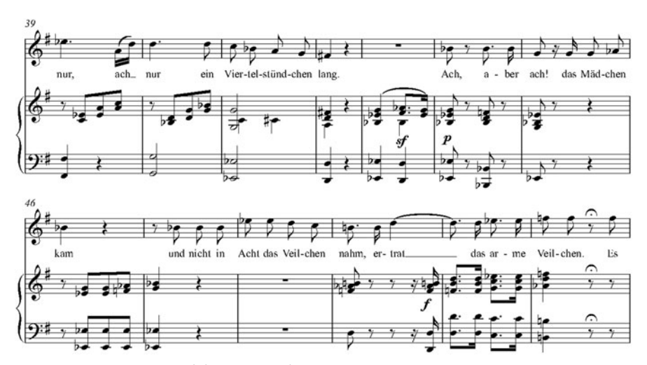
Ex. 6 Mozart, 'Das Veilchen', K476, bars 39-51

vocal line ascends to a top G, the speaker/singer shares the terrible joy of the flower. <sup>62</sup> Both flower and speaker are thus coded as male. Mozart adds the lines 'Das arme Veilchen! Es war ein herzigs Veilchen' ('The poor violet! It was a dear sweet violet') as if to confirm the speaker's embodied empathy with the flower.