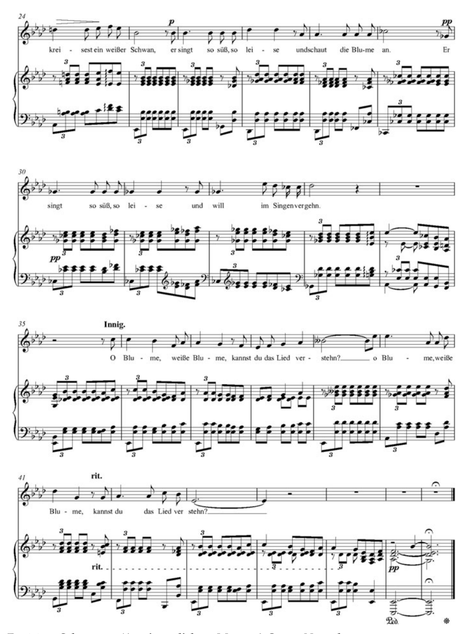
Ex. 1.1 Schumann, 'An einem lichten Morgen', Op. 23 No. 2, bars 8–20.

Where Robert crosses the flat–sharp threshold to create this gateway, the analogous passage in Clara's song instead sinks further into the flat realm (I to \VI), as if falling into an ever-deeper slumber. This harmonic progression similarly attempts to induce a harmonic gateway to a dream-like world, in the hope the flower might answer the swan, but it yields no flower speech. The song lingers on C-flat for the beginning of the final stanza, as the singer, now in hushed tones, repeats the alliterative singing of the swan. At this moment, the piano separates itself from the melodic outline of the