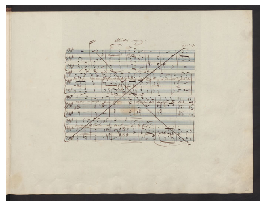
Fig. 3 Crossed out strophe of 'Was weinst du, Blümlein' in the autograph. 48

(4c). Schumann positions these modal turns against the grain of the poetry, defying the formulaic pattern of mishearing in the poem and anticipating a thought that maybe this time round the poetic persona will not mishear the sorrows of nature.