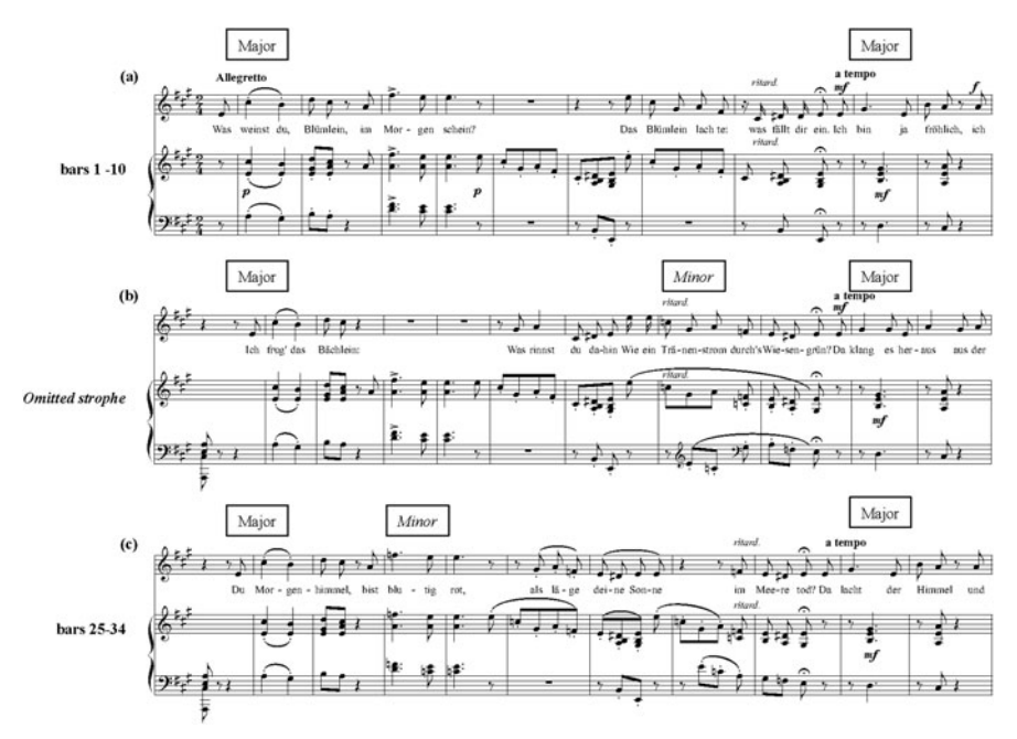
Ex. 4 Major-minor turns in 'Was weinst du, Blümlein' with omitted strophe

Accordingly, there are no glimpses here of the dialectical/modal turns we saw in the first song; Schumann sets the entire song firmly in the minor mode. Taking into account the gender of the characters assigned to the poems of Op. 23, the modal turns of 'Was weinst du, Blümlein' comes to represent a feminine perspective on the mutability of flowers not afforded to the male Brunold.