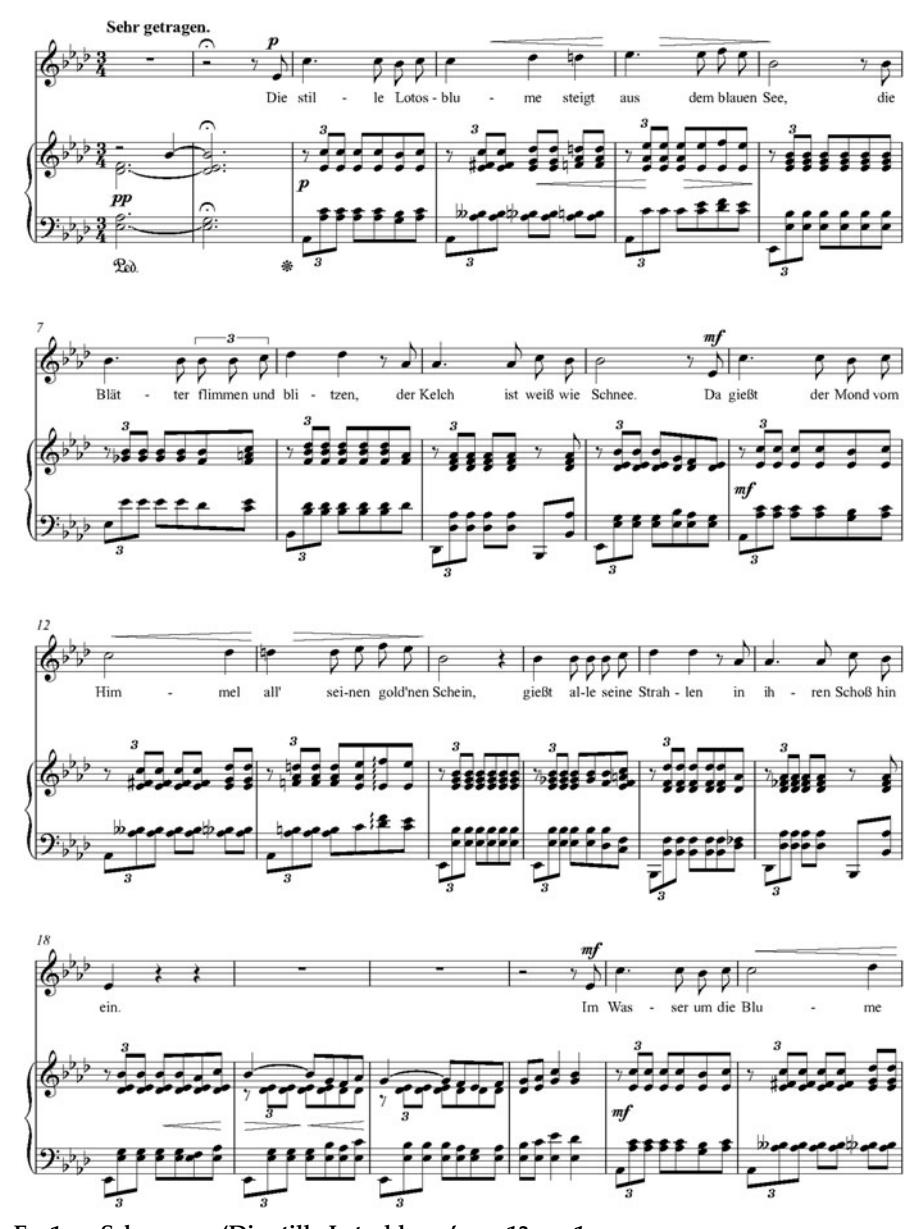
Ex. 1 Schumann, 'Die stille Lotosblume', op. 13 no. 1