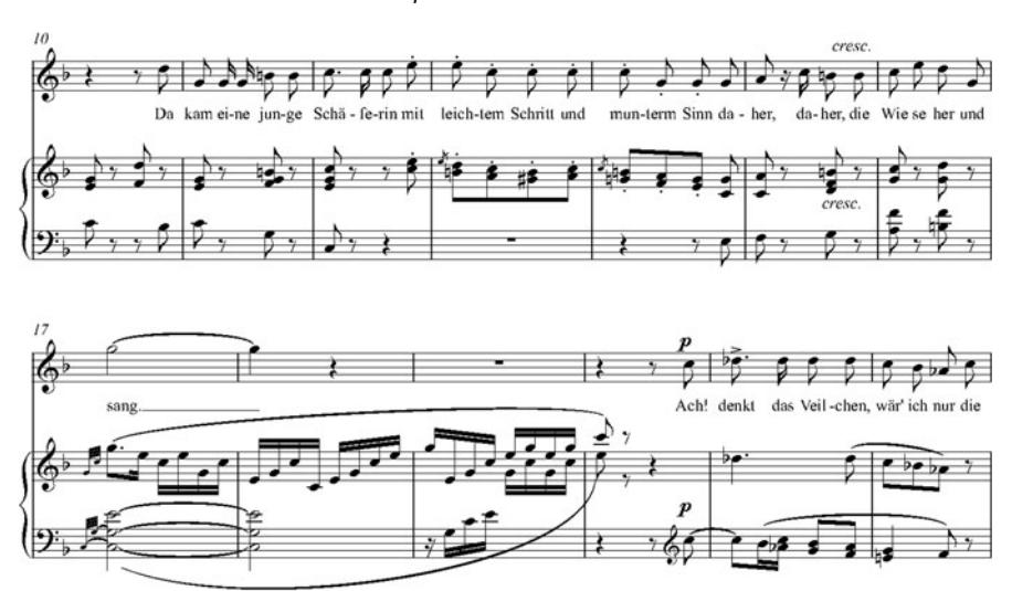
Ex. 7 Schumann, 'Das Veilchen', bars 10-22

rupture the otherwise innocent mood of the song with a drastic gesture on the word 'sang'. In so doing, the singer's voice momentarily melds with the imagined song of the shepherdess, linking the speaker of the poem to the singing body of the violet's oblivious sweetheart. By announcing the singing of the shepherdess on this loud, prolonged dominant, one would be forgiven for expecting the actual song of the shepherdess in the following stanza, perhaps in F major. But instead we hear the perspective of the violet in a quiet F minor, emphasizing the chasm between the world of the shepherdess and the violet, and substantiating the impossibility of communion between the men and women thematized in other flower lieder.