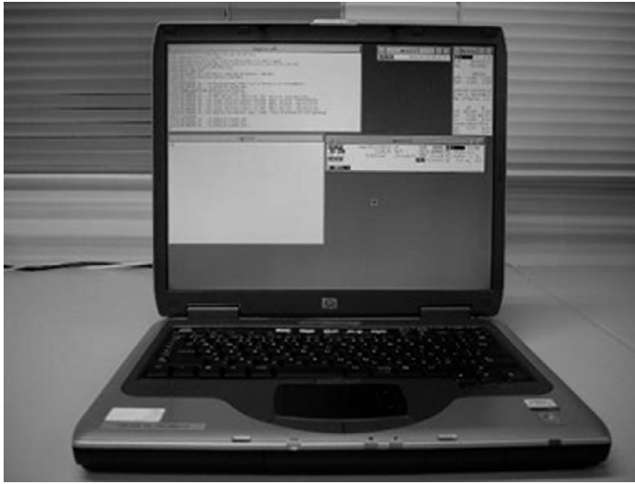
Figure 1. Laptop Compaq nx9005 running Field System FS9