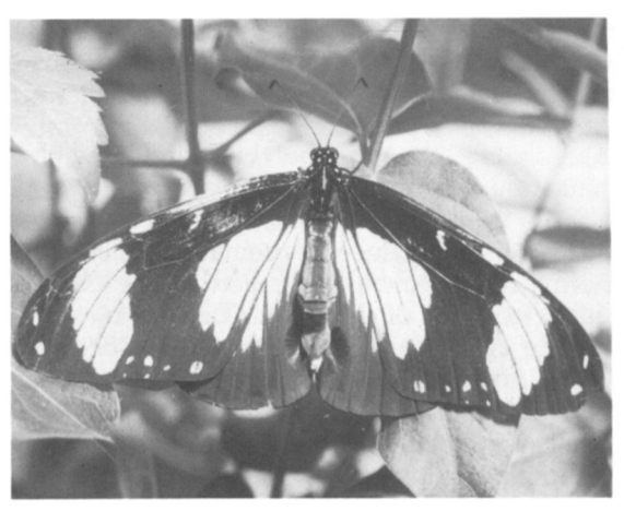
Amauris niavius, showing the abdominal brushes, which, when in contact with the hindwing patches, produce sexpheromones.