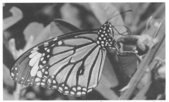
Male Danaus genutia 'feeding' on Crotalaria retusa to obtain pyrrolizidine alkaloids, precursors of major components of their sex-pheromones. This behaviour, which is independent of 'normal' feeding, probably contributes towards their unpalatability.

book. In reading the pages one feels a sense of history unfolding: Henry Bates pondering over the mysteries of mimicry in the butterflies of the Amazon jungle, Alfred Russel Wallace extending those ideas to the Orient and considering natural selection. The protection incurred by unpalatable chemicals was long suspected to be the reason why other species mimic milkweed butterflies, but it was not until the 1960s that toxic cardenolides and alkaloids were isolated, capable of inhibiting the action of vital nerve and muscle enzymes. Since then, the science of ecological chemistry has expanded and the exciting story of coevolution between plants and animals has continued to unfold. The biological arms race of the natural world is not only a driving force in