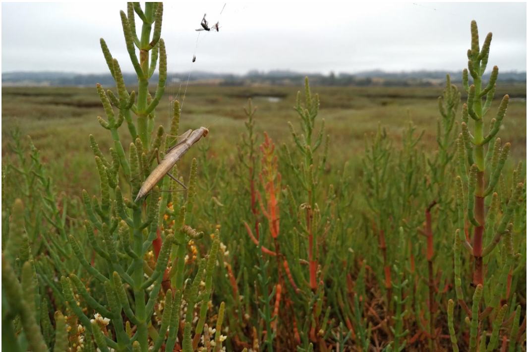
Figure 1. A juvenile, and thus flightless, European mantid, Mantis religiosa , climbs up a stalk of pickleweed, Salicornia pacifica .

Linnaeus, 1758 (Mantodea: Mantidae), has long been used for this biocontrol purpose because it is a large mantid species. European mantids on the North American east coast are recorded as far back as the 1890s (McLeod 1962). Database and photographic records exist for M. religiosa starting as early as 2002 in various counties in California, United States of America, but M. religiosa likely arrived and was spreading in California during the late 1900s (Global Biodiversity Information Facility 2022). Since then, the range of the European mantid has expanded, and it now occurs throughout the west coast of the United States of America (Global Biodiversity Information Facility 2022; CalPhotos, https://calphotos.berkeley.edu/ , unlike in the distribution map in Battiston et al. 2010).