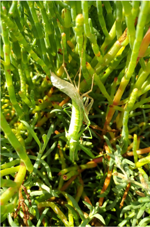
Figure 2. A green morph European mantid, Mantis religiosa , moulting while attached to pickleweed, Salicornia pacifica . This is the mantid's final moult before becoming an adult.

desert saltgrass, Distichlis spicata (Linnaeus) Greene (Poaceae) (two mantids; 7.7%), and salt-marsh dodder, Cuscuta pacifica , Costea and M.R. Wright (Convolvulaceae), parasitising pickleweed (one mantid; 3.8%; Supplementary material ). Mantids were measured using the programme ImageJ ( https://imagej.net ) and calibrated with a ruler in the photos. Mantid length ranged from 2.38 to 5.00 cm, with an average length of 3.84 cm ( n = 23 ; Supplementary material ). Colour morphs ranged: we observed 13 green (50%), five brown (20%), four light brown (15%), and four pale (15%) mantids.